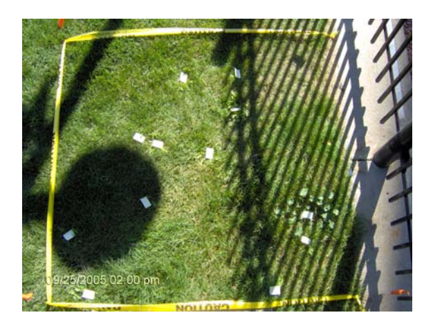
Figure 1 15 weeds in a 25 square foot patch Injury Threshold