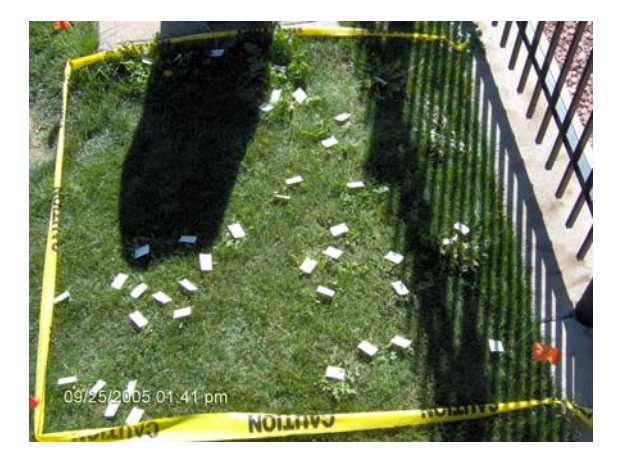
Figure 3 45 weeds in a 25 square foot patch Damage Threshold