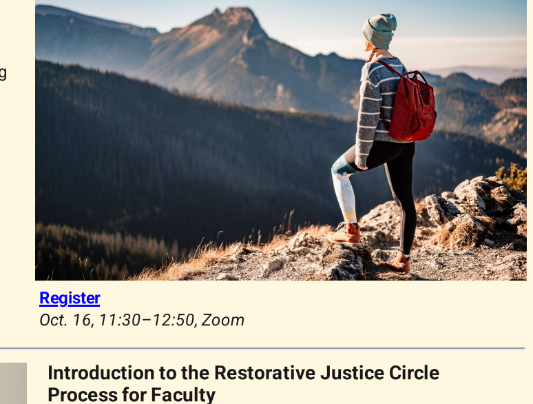
Faculty Affairs, will provide an overview and practical applications of the restorative justice circle process in various academic contexts.