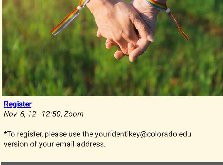
impacts for students when we don't use inclusive practices?

Oct. 30, 12-12:50, Zoom Addressing the Needs of LGBTQIA+ Students