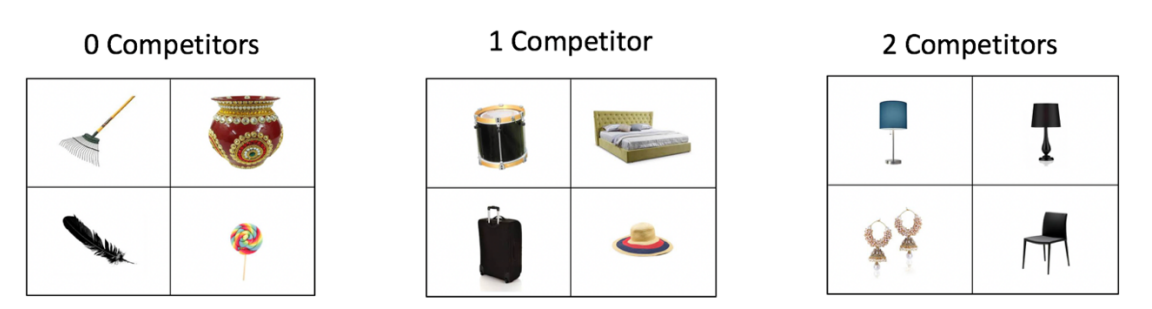
Fig.1 : Sample displays from the three visual conditions in the Color Adjective condition. The targets were, from left to right, 'the black feather', 'the black drum' and 'the black lamp'. Similar displays were constructed for Material and Scalar adjectives.