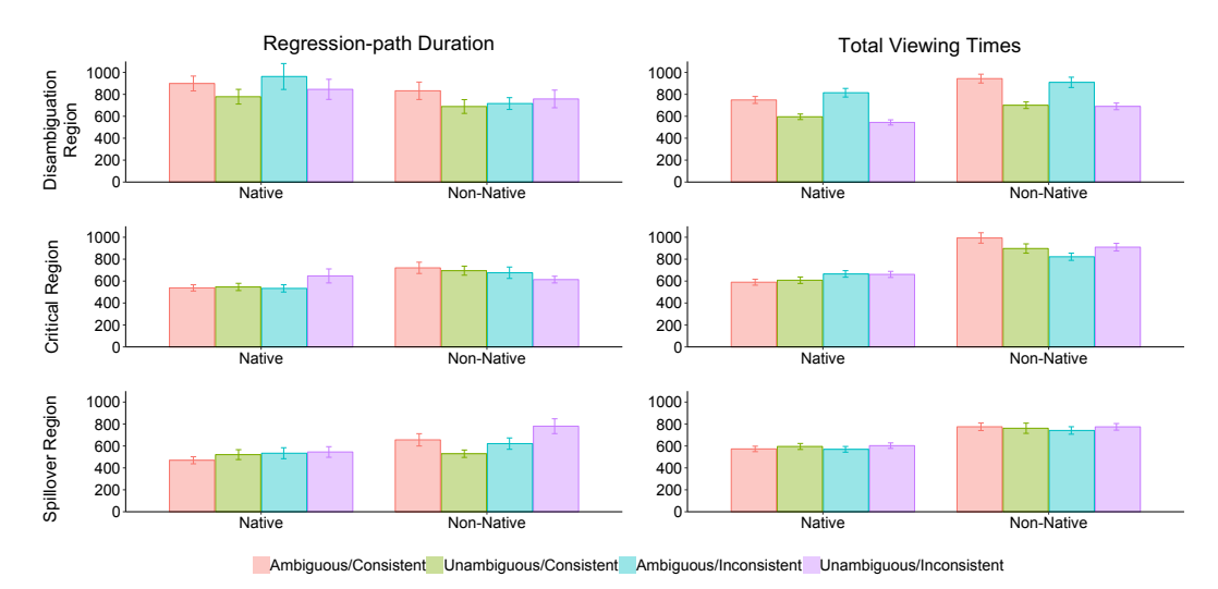
Figure 2. Reading times in Ex2. Note: Disambiguation Region = "earlier", Critical Region = "the school bus", Spillover Region = "very patiently on".