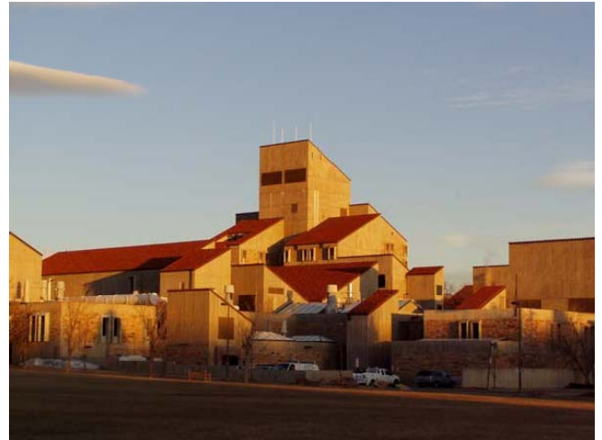
The Engineering Center at the University of Colorado at Boulder

To address these challenges, environmental engineers often encounter challenging problems that must be solved in data-poor situations as members of multidisciplinary teams. Environmental problems require creative solutions with contributions from scientists, lawyers, business people, and the public. Good communication skills, as well as technical proficiency, are essential for success in this arena. In addition, technology designed to address environmental problems is marketed globally, opening up increasing opportunities for international work in the environmental engineering field.