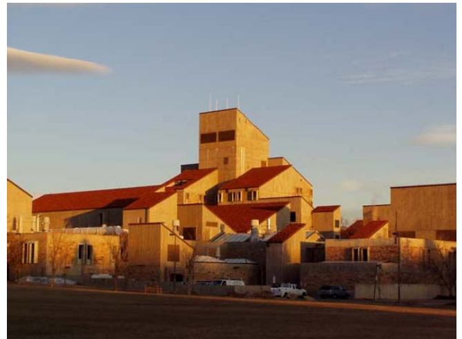
The Engineering Center at the University of Colorado at Boulder

To address these challenges, environmental engineers often encounter challenging problems that must be solved in data-poor situations as members of multidisciplinary teams. Environmental problems require creative solutions with contributions from scientists, lawyers, business people, and the public. Good communication skills, as well as technical proficiency, are essential for success in this arena. In addition, technology designed to address environmental problems is marketed globally, opening up increasing opportunities for international work in the environmental engineering field.