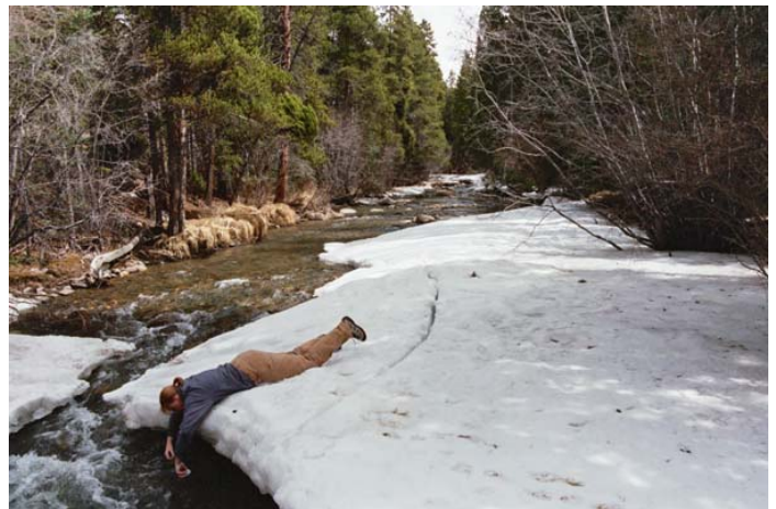
EVEN/CHEN 2004 graduate Lily Isenhart perches precariously for a precious water sample from the Snake River in Summit County.

Instructor's consent must be obtained on a petition form if prerequisites are not met. Permission must be obtained from the relevant department if courses have other restrictions.