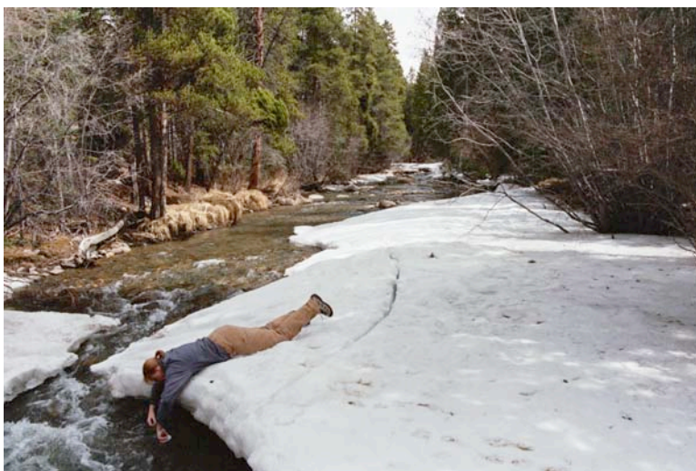
EVEN/CHEN 2004 graduate Lily Isenhart perches precariously for a precious water sample from the Snake River in Summit County.

Students are required to take one 3-credit course with a significant lab or field component focusing on air quality or earth science. If the course chosen is less than three credits, upper division technical electives must complete the remaining