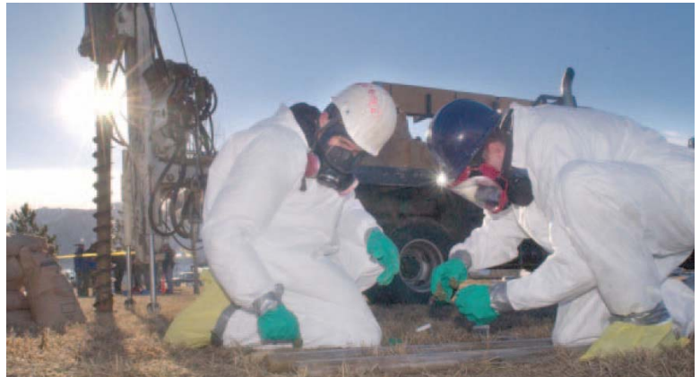
EVEN students examine a soil sample collected by hollow-stem auger drilling during the EVEN 4830 Environmental Sampling and Analysis course in Spring 2003.

The curriculum below shows the recommended sequence of courses. In each curricula, courses marked with an asterisk (*) are offered only in the semester shown. Other courses are offered in both semesters. For example, the required course in Probability and Statistics (third-year fall in the EVEN BS curriculum) may be taken in another semester (provided that all prerequisite and co-requisite course requirements are met) because Probability and Statistics is not required by a course following it in the curriculum schedule.