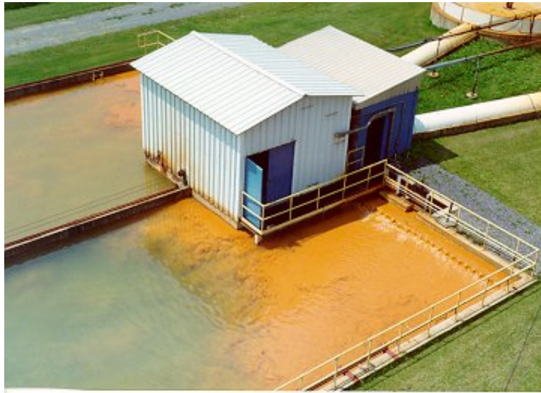
A settling pond for the treatment of acid mine drainage.

Guidance on selection of Option courses, Humanities and Social Science (H&SS) courses, and technical elective courses is offered in Section 4.