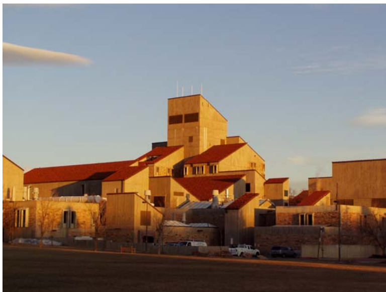
The Engineering Center at the University of Colorado at Boulder.

To address these challenges, environmental engineers often encounter challenging problems that must be solved in data-poor situations as members of multidisciplinary teams. Environmental problems require creative solutions blended with contributions from scientists, lawyers, business people, and the public. Good communication skills, as well as technical proficiency, are essential for success in this arena. In addition, technology designed to address environmental problems is marketed globally, opening up increasing opportunities for international work in the environmental engineering field.