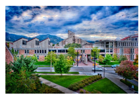
The Engineering Center at the University of Colorado at Boulder.

Environmental engineers play a vital role in maintaining the quality of both human environmental systems and the natural environment. Environmental engineering encompasses the scientific assessment and development of engineering solutions to environmental problems impacting the biosphere, land, water, and air quality. Environmental issues affect almost all commercial and industrial sectors, and are a central concern for the public, for all levels of government, and in international relations. These issues include safe drinking water, wastewater processing, solid and hazardous waste disposal, outdoor air pollution, indoor air pollution, transfer of infectious diseases, human health and ecological risk management, renewable and sustainable energy sources and their effects on the environment, and prevention of pollution through product or process design.