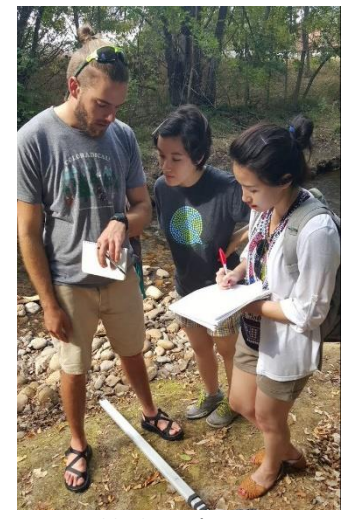
EVEN 4100: Ground Water Sampling, Fort Collins, CO.

Grades of D+, D, D-, F, IF, IW, P or NC do not satisfy this requirement. Successful completion of prerequisite and co-requisite courses will be monitored for all required courses in the Environmental Engineering curriculum. Students who do not successfully complete prerequisite and co-requisite courses must retake those courses before advancing in the curriculum. If a student registers for a course without satisfactorily