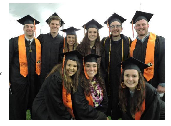
EVEN Graduation - May 2019

Other grades appearing on student transcripts include Incomplete (I), No Credit (NC), and Pass (P). A grade of I indicates that course requirements were not completed owing to documented reasons beyond the control of the student.