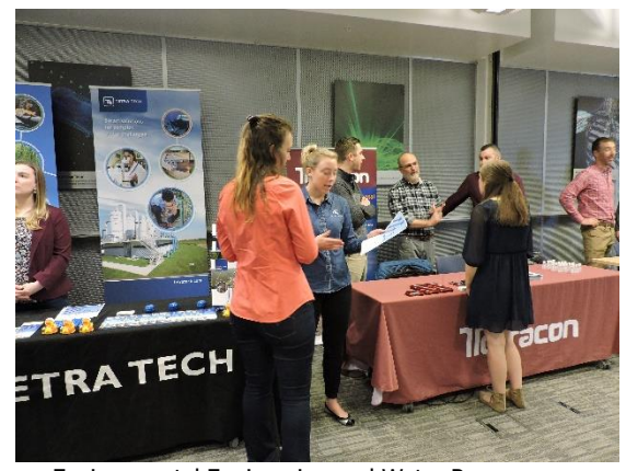
Environmental Engineering and Water Resources Networking Event, February 2019

Once the Office of Admissions has completed its evaluation, the student will meet with the EVEN Advisor for evaluation of transfer credits for the EVEN curriculum. Note that acceptance of transfer credits by the admissions office does not ensure that the transfer credits will count toward the EVEN BS degree; courses taken at another institution must match the course requirements for the EVEN curriculum. In many cases, identification of courses is straightforward; however, for some courses, the EVEN Director may request documentation of course content (catalog descriptions, course syllabi).