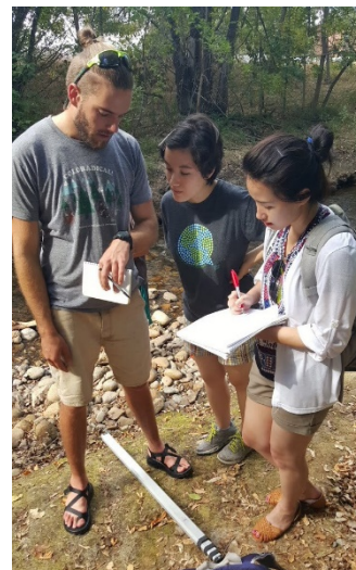
EVEN 4100: Ground Water Sampling, Fort Collins, CO.

The prerequisite and co-requisite policy applies only to required and environmental engineering upper-division technical elective courses in the curriculum. If a student has not satisfied all of the prerequisite and co-requisite requirements for an