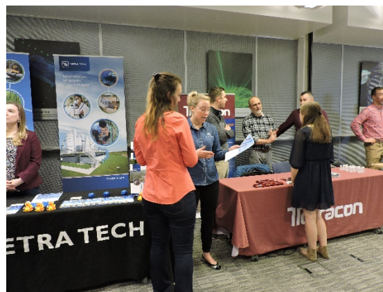
Environmental Engineering and Water Resources Networking Event, February 2019

Once the Office of Admissions has completed its evaluation, the student will meet with the EVEN Advisor for evaluation of transfer credits for the EVEN curriculum. Note that acceptance of transfer credits by the admissions office does not ensure that the transfer credits will count toward the EVEN BS degree; courses taken at another institution must match the course requirements for the EVEN curriculum. In many cases, identification of courses is straightforward; however, for some courses, the EVEN Director may request documentation of course content (catalog descriptions, course syllabi).