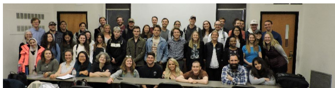
EVEN Senior Design Class of 2019

Colorado residents should be aware that the College Opportunity Fund (COF) may not cover all tuition costs associated with a double degree program (those beyond 145 semester credit hours).