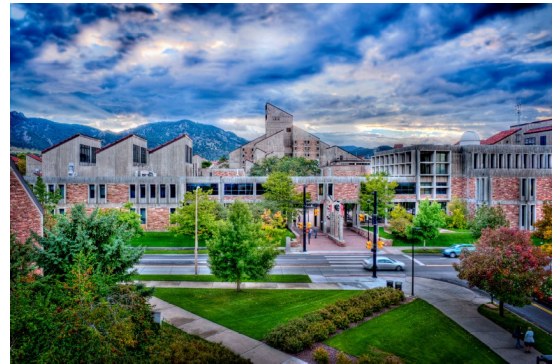
The Engineering Center at the University of Colorado at Boulder.

To address these challenges, environmental engineers often encounter challenging problems that must be solved in data-poor situations as members of multidisciplinary teams. Environmental problems require creative solutions with contributions from scientists, lawyers, business professionals, and the public. Good communication skills, as well as technical proficiency, are essential for success in this arena. In addition, technology designed to address environmental problems is marketed globally, which opens up increasing opportunities for international work in the environmental engineering field.