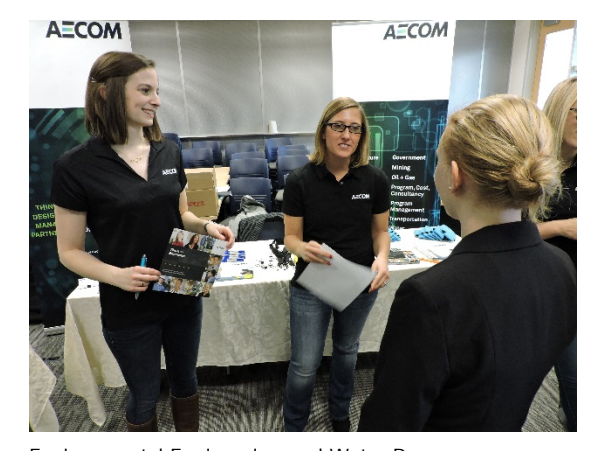
Environmental Engineering and Water Resources Networking Event, February 2018

Once the Office of Admissions has completed its evaluation, the student will meet with the EVEN Advisor for evaluation of transfer credits for the EVEN curriculum. Note that acceptance of transfer credits by the admissions office does not ensure that the transfer credits will count toward the EVEN BS degree; courses taken at another institution must match the course requirements for the EVEN curriculum. In many cases, identification of courses is straightforward; however, for some courses, the EVEN Director may request documentation of course content (catalog descriptions, course syllabi).