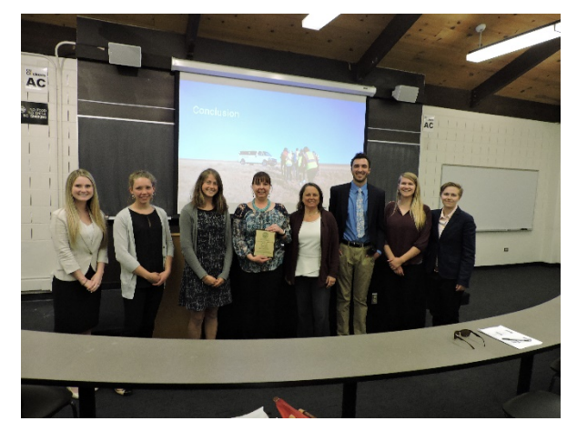
2017 EVEN Senior Design Team wins 1st place at ACRP Competition