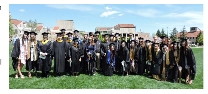
EVEN Graduation Class - May 2018