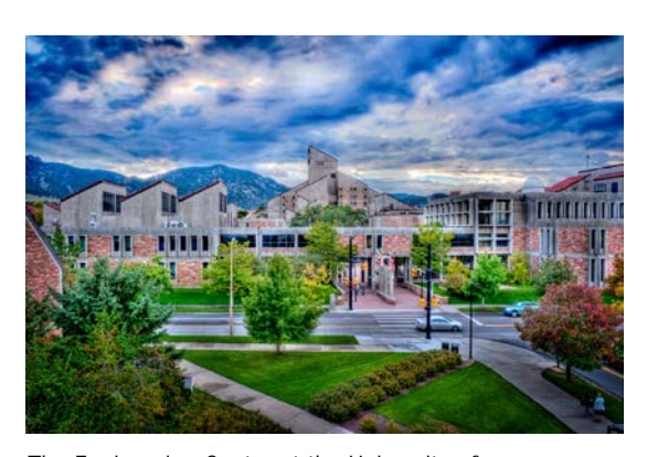
The Engineering Center at the University of Colorado at Boulder.

Environmental engineers play a vital role in maintaining the quality of both human environmental systems and the natural environment. Environmental engineering encompasses the scientific assessment and development of engineering solutions to environmental problems impacting the biosphere, land, water, and air quality. Environmental issues affect almost all commercial and industrial sectors, and are a central concern for the public, for all levels of government, and in international relations. These issues include safe drinking water, wastewater processing, solid and hazardous waste disposal, outdoor air pollution, indoor air pollution, transfer of infectious diseases, human health and ecological risk management, prevention of pollution through product or process design, and renewable and sustainable energy sources and their effects on the environment.