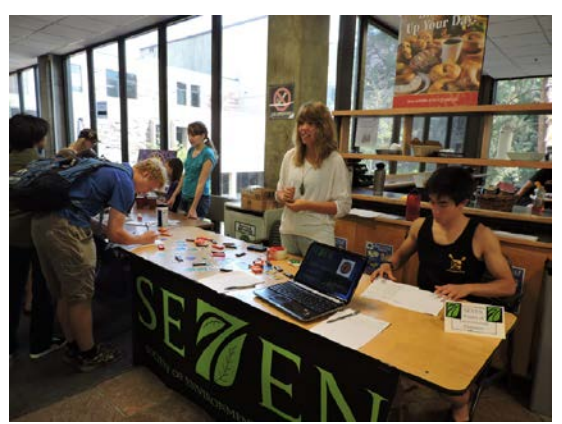
SEVEN, Society of EVEN is a resource for engineering students to connect and explore applications of environmental engineering

Approval of a second independent study is contingent on successful completion of the requirements for the first independent study.