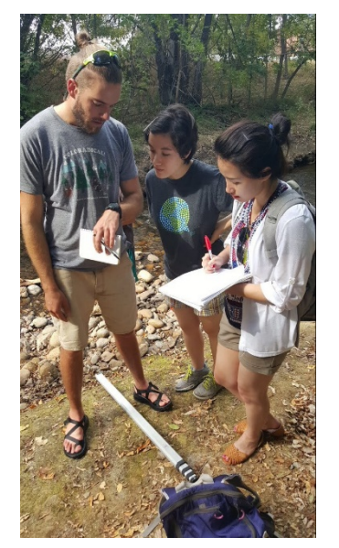
EVEN 4100: Ground Water Sampling, Fort Collins, CO.

Students must successfully complete all prerequisite courses before enrolling for a required course in the Environmental Engineering curriculum. Students must also simultaneously enroll in and complete satisfactorily all co-requisite courses. Successful completion means receiving a grade of C- or better (some courses require a grade of C in prerequisites). Grades of D+, D, D-, F, IF, IW, P or NC do not satisfy this requirement. Successful completion of prerequisite and co-requisite courses will be monitored for all required courses in the Environmental Engineering curriculum. Students who do not successfully complete prerequisite and co-requisite courses must retake those courses before advancing in the curriculum. If a student registers for a course without satisfactorily completing prerequisite courses, he/she will be notified that the course must be dropped and, if necessary, the student will be dropped from the course. Students required to