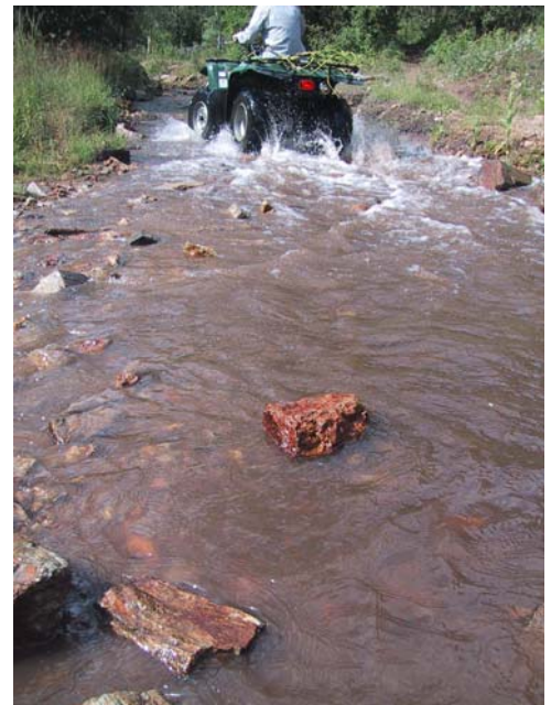
EVEN 2001 graduate Durelle Scott (the headless rider) drives an ATV in a flooded road near a creek to simulate the generation of suspended sediment by off-highway vehicle recreation.