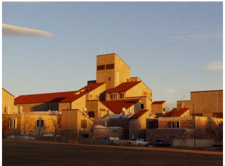
The Engineering Center at the University of Colorado at Boulder.

To address these challenges, environmental engineers often encounter challenging problems that must be solved in data-poor situations as members of multidisciplinary teams. Environmental problems require creative solutions blended with contributions from scientists, lawyers, business people, and the public. Good communication skills, as well as technical proficiency, are essential for success in this arena. In addition, technology designed to address environmental problems is marketed globally, opening up increasing opportunities for international work in the environmental engineering field.