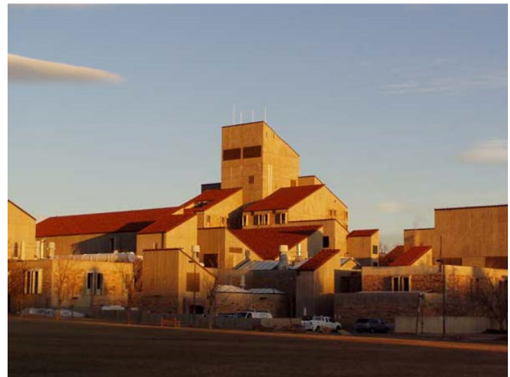
The Engineering Center at the University of Colorado at Boulder

To address these challenges, environmental engineers often encounter challenging problems that must be solved in data-poor situations as members of multidisciplinary teams. Environmental problems require creative solutions with contributions from scientists, lawyers, business people, and the public. Good communication skills, as well as technical proficiency, are essential for success in this arena. In addition, technology designed to address environmental problems is marketed globally, opening up increasing opportunities for international work in the environmental engineering field.