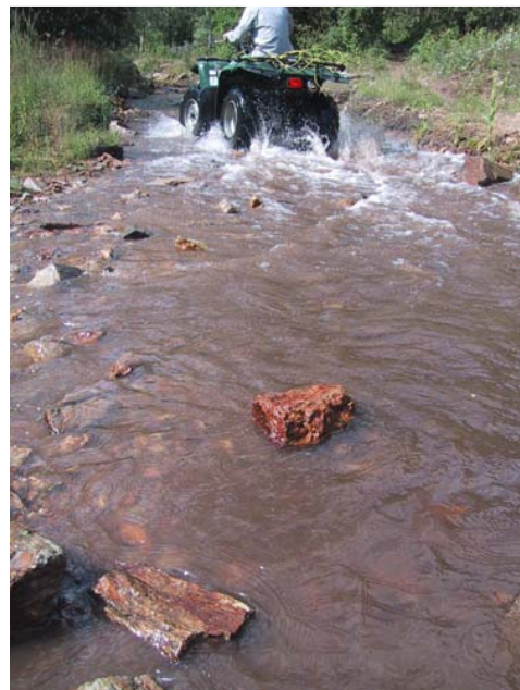
EVEN 2001 graduate Durelle Scott (the headless rider) drives an ATV in a flooded road near a creek to simulate the generation of suspended sediment by off-highway vehicle recreation.

A maximum of 16 credit hours taken through Continuing Education programs other than Summer Session can be applied to the EVEN BS degree (Maymester and Summer Session courses are equivalent to courses offered during the regular academic year). A maximum of 8 of the 16 credit hours can be taken as Humanities and Social Sciences courses. Registration occurs through the mycuinfo portal, but students should be advised that a separate tuition charge may apply.