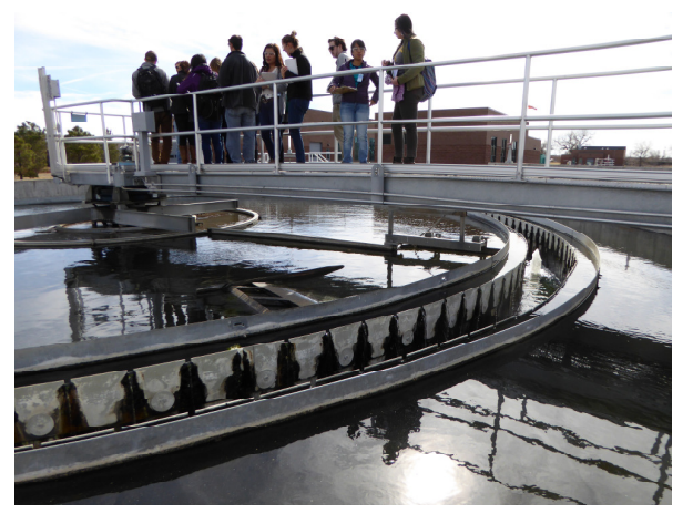
2016 Senior Design Teams visiting the Parker Northern Wastewater Reclamation Facility.