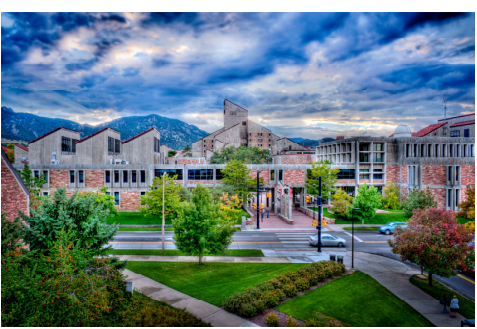
The Engineering Center at the University of Colorado at Boulder.

Environmental engineers play a vital role in maintaining the quality of both human environmental systems and the natural environment. Environmental engineering encompasses the scientific assessment and development of engineering solutions to environmental problems impacting the biosphere, land, water, and air quality. Environmental issues affect almost all commercial and industrial sectors, and are a central concern for the public, for all levels of government, and in international relations. These issues include safe drinking water, wastewater processing, solid and hazardous waste disposal, outdoor air pollution, indoor air pollution, transfer of infectious diseases, human health and ecological risk management, prevention of pollution through product or process design, and renewable and sustainable energy sources and their effects on the environment.