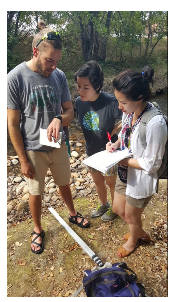
EVEN 4100: Ground Water Sampling, Fort Collins, CO.

Several types of students transfer into the Environmental Engineering program. For all transfer students, the College of Engineering and Applied Science requires that the last 45 credit hours used to fulfill degree requirements must be CU-Boulder coursework taken after admission to the college. More details about the college's transfer credit policies are available in the Dean's office or online at the following URL on the college website (http://www.colorado.edu/engineering/admissions/transfer).