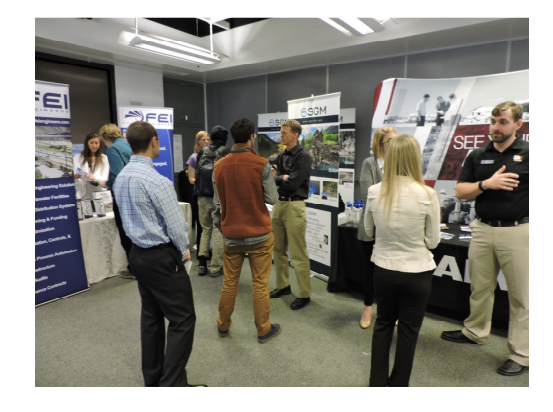
Environmental Engineering and Water Resources Networking Event, March 2016

Once the Office of Admissions has completed its evaluation, the student will meet with the EVEN Director for evaluation of transfer credits for the EVEN curriculum. Note that acceptance of transfer credits by the admissions office does not ensure that the transfer credits will count toward the EVEN BS degree; courses taken at another institution must match the course requirements for the EVEN curriculum. In many cases, identification of courses is straightforward; however, for some courses, the EVEN Director may request documentation of course content (catalog descriptions, course syllabi).