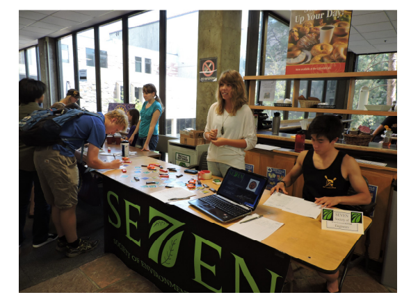
SEVEN, Society of EVEN is a resource for engineering students to connect and explore applications of environmental engineering.