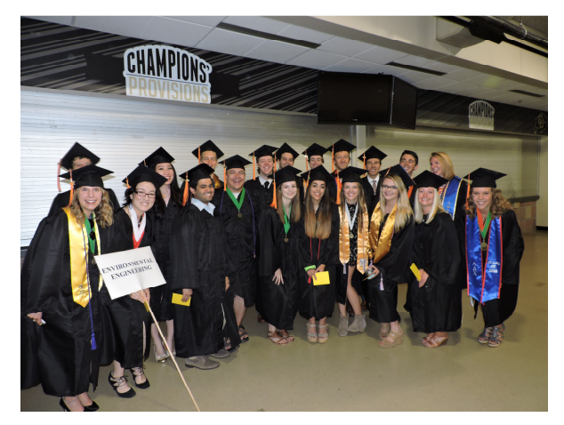
EVEN Graduation Class - May 2016

The curriculum below shows the recommended sequence of courses. Courses marked with an asterisk (*) are offered only in the semester shown (fall or spring). Other courses are offered in both semesters,