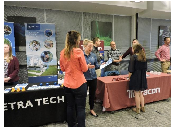
Environmental Engineering and Water Resources Networking Event, February 2019

Once the Office of Admissions has completed its evaluation, the student will meet with the EVEN Advisor for evaluation of transfer credits for the EVEN curriculum. Note that acceptance of transfer credits by the admissions office does not ensure that the transfer credits will count toward the EVEN BS degree; courses taken at another institution must match the course requirements for the EVEN curriculum. In many cases, identification of courses is straightforward; however, for some courses, the EVEN Director may request documentation of course content (catalog descriptions, course syllabi).