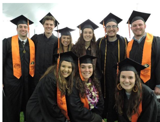
EVEN Graduation - May 2019

Graduation will be postponed by failure to complete these requirements. Any exceptions to these requirements will require approval of the Environmental Engineering Program Director and the Dean's office by petition. In addition, students must be recommended for graduation by the faculty of the EVEN Program and the faculty of the college, and should complete the senior survey.