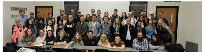
EVEN Senior Design Class of 2019

Colorado residents should be aware that the College Opportunity Fund (COF) may not cover all tuition costs associated with a double degree program (those beyond 145 semester credit hours).