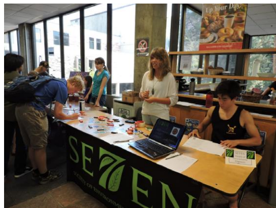
SEVEN, Society of EVEN is a resource for engineering students to connect and explore applications of environmental engineering