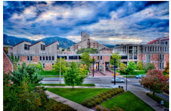
The Engineering Center at the University of Colorado at Boulder.

To address these challenges, environmental engineers often encounter challenging problems that must be solved in data-poor situations as members of multidisciplinary teams. Environmental problems require creative solutions with contributions from scientists, lawyers, business professionals, and the public. Good communication skills, as well as technical proficiency, are essential for success in this arena. In addition, technology designed to address environmental problems is marketed globally, which opens up increasing opportunities for international work in the environmental engineering field.