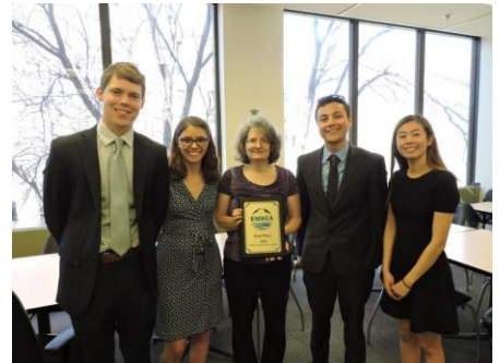
2019 EVEN Senior Design Team wins 1st place First Place at RMWEA Student Design Competition