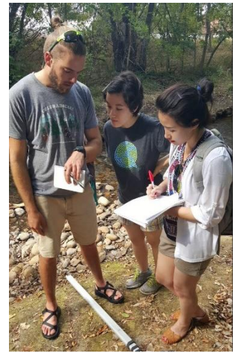
EVEN 4100: Ground Water Sampling, Fort Collins, CO.

Students transferring into EVEN from another of the University of Colorado at Boulder's Colleges and Schools must complete the Intra-University Transfer (IUT) application process . Once the application is approved, credit hours from the non-engineering degree will be evaluated for EVEN credit at the first advising meeting with the EVEN Program Director.