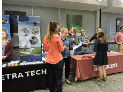
Environmental Engineering and Water Resources Networking Event, February 2019

Once the Office of Admissions has completed its evaluation, the student will meet with the EVEN Advisor for evaluation of transfer credits for the EVEN curriculum. Note that acceptance of transfer credits by the admissions office does not ensure that the transfer credits will count toward the EVEN BS degree; courses taken at another institution must match the course requirements for the EVEN curriculum. In many cases, identification of courses is straightforward; however, for some courses, the EVEN Director may request documentation of course content (catalog descriptions, course syllabi).