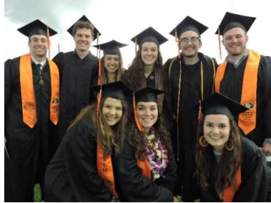
EVEN Graduation - May 2019

Graduation will be postponed by failure to complete these requirements. Any exceptions to these requirements will require approval of the Environmental Engineering Program Director and the Dean's office by petition. In addition, students must be recommended for graduation by the faculty of the EVEN Program and the faculty of the college, and should complete the senior survey.