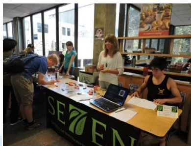
SEVEN, Society of EVEN is a resource for engineering students to connect and explore applications of environmental engineering

Commented [AMS5]: Generally there have not been periods after bullet points throughout the document