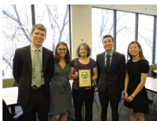
2019 EVEN Senior Design Team wins 1st place First Place at RMWEA Student Design Competition