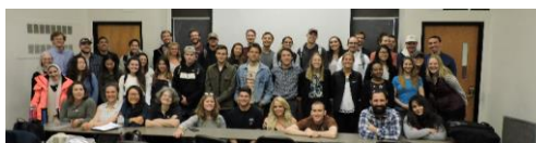
EVEN Senior Design Class of 2019

Colorado residents should be aware that the College Opportunity Fund (COF) may not cover all tuition costs associated with a double degree program (those beyond 145 semester credit hours).