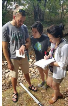
EVEN 4100: Ground Water Sampling, Fort Collins, CO.

Courses not listed in the curriculum may be used to satisfy prerequisite and co-requisite requirements if transfer credit or a petition to the Environmental Engineering Program has been approved. College of Engineering and Applied Science petition forms for this purpose may be obtained from the Academic Advisor or online .