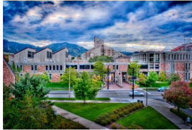
The Engineering Center at the University of Colorado at Boulder.

Environmental engineering encompasses the scientific assessment and development of engineering solutions to environmental problems impacting the biosphere, land, water, and air quality. Environmental issues affect almost all commercial and industrial sectors, and are a central concern for the public, for all levels of government, and in international relations. These issues include safe drinking water, wastewater processing, solid and hazardous waste disposal, outdoor air pollution, indoor air pollution, transfer of infectious diseases, human health and ecological risk management, renewable and sustainable energy sources and their effects on the environment, and prevention of pollution through product or process design.