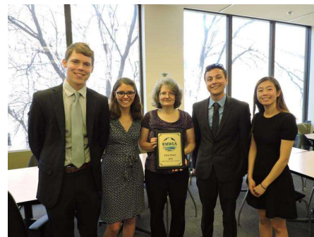
2019 EVEN Senior Design Team wins 1st place First Place at RMWEA Student Design Competition