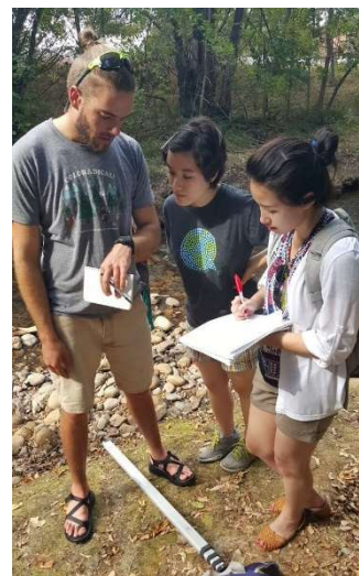
EVEN 4100: Ground Water Sampling, Fort Collins, CO.

Students transferring into EVEN from another of the University of Colorado at Boulder's Colleges and Schools must complete the Intra-University Transfer (IUT) application process . Once the application is approved, credit hours from the non-engineering degree will be evaluated for EVEN credit at the first advising meeting with the EVEN Program Director.