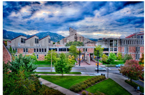
The Engineering Center at the University of Colorado at Boulder.

Students began entering the program in the fall of 1998. The first EVEN degree was awarded in December 1999 (to a student who transferred into the program as a third-year student), and the first EVEN class graduated in June 2002.