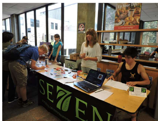
SEVEN, Society of EVEN is a resource for engineering students to connect and explore applications of environmental engineering