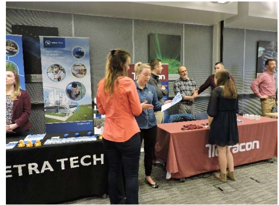
Environmental Engineering and Water Resources Networking Event, February 2019

Once the Office of Admissions has completed its evaluation, the student will meet with the EVEN Advisor for evaluation of transfer credits for the EVEN curriculum. Note that acceptance of transfer credits by the admissions office does not ensure that the transfer credits will count toward the EVEN BS degree; courses taken at another institution must match the course requirements for the EVEN curriculum. In many cases, identification of courses is straightforward; however, for some courses, the EVEN Director may request documentation of course content (catalog descriptions, course syllabi).