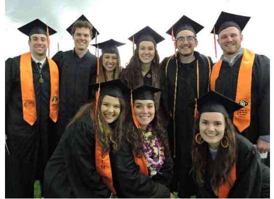
EVEN Graduation - May 2019

Graduation will be postponed by failure to complete these requirements. Any exceptions to these requirements will require approval of the Environmental Engineering Program Director and the Dean's office by petition. In addition, students must be recommended for graduation by the faculty of the EVEN Program and the faculty of the college, and should complete the senior survey.