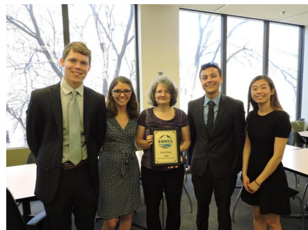
2019 EVEN Senior Design Team wins 1st place First Place at RMWEA Student Design Competition