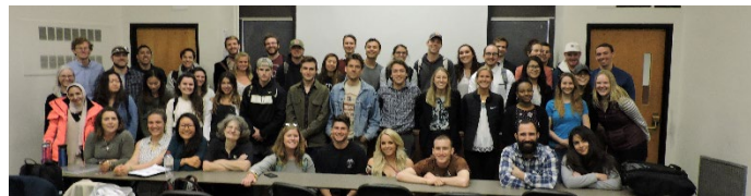
EVEN Senior Design Class of 2019

The Environmental Engineering Program offers a Bachelor's–Accelerated Master's (BAM) Degree Program in Environmental Engineering. The EVEN Program is also cooperating with the Department of Civil, Environmental and Architectural Engineering to offer a BAM Degree Program in Civil Engineering with an Environmental Engineering emphasis, and with the Department of Mechanical Engineering to offer a BAM Degree Program in Mechanical Engineering.