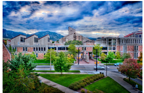
The Engineering Center at the University of Colorado at Boulder.

To address these challenges, environmental engineers often encounter challenging problems that must be solved in data-poor situations as members of multidisciplinary teams. Environmental problems require creative solutions with contributions from scientists, lawyers, business people, and the public. Good communication skills, as well as technical proficiency, are essential for success in this arena. In addition, technology designed to address environmental problems is marketed globally, opening up increasing opportunities for international work in the environmental engineering field.