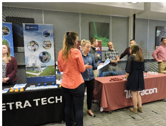
Environmental Engineering and Water Resources Networking Event, February 2019

Once the Office of Admissions has completed its evaluation, the student will meet with the EVEN Advisor for evaluation of transfer credits for the EVEN curriculum. Note that acceptance of transfer credits by the admissions office does not ensure that the transfer credits will count toward the EVEN BS degree; courses taken at another institution must match the course requirements for the EVEN curriculum. In many cases, identification of courses is straightforward; however, for some courses, the EVEN Director may request documentation of course content (catalog descriptions, course syllabi).