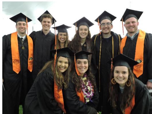
EVEN Graduation - May 2019

Graduation will be postponed by failure to complete these requirements. Any exceptions to these requirements will require approval of the Environmental Engineering Program Director and the Dean's office by petition. In addition, students must be recommended for graduation by the faculty of the EVEN Program and the faculty of the college, and should complete the senior survey.