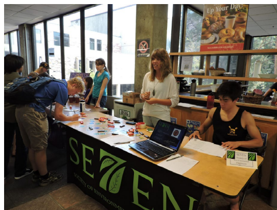
SEVEN, Society of EVEN is a resource for engineering students to connect and explore applications of environmental engineering