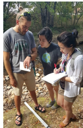
EVEN 4100: Ground Water Sampling, Fort Collins, CO.

Students must successfully complete all prerequisite courses before enrolling for a required course in the Environmental Engineering curriculum. Students must also simultaneously enroll in and complete satisfactorily all co-requisite courses. Successful completion means receiving a grade of C- or better (some courses require a grade of C in prerequisites). Grades of D+, D, D-, F, IF, IW, P or NC do not satisfy this requirement. Successful completion of prerequisite and co-requisite courses will be monitored for all required courses in the Environmental Engineering curriculum. Students who do not successfully