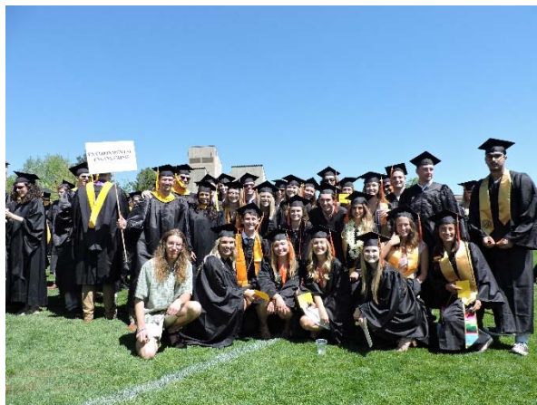
EVEN Graduation Class - May 2017

Graduation will be postponed by failure to complete these requirements. Any exceptions to these requirements will require approval of the Environmental Engineering Program Director and the Dean's office by petition. In addition, students must be recommended for graduation by the faculty of the EVEN Program and the faculty of the college, and should complete the senior survey.