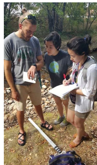
EVEN 4100: Ground Water Sampling, Fort Collins, CO.

Grades of D+, D, D-, F, IF, IW, P or NC do not satisfy this requirement. Successful completion of prerequisite and co-requisite courses will be monitored for all required courses in the Environmental Engineering curriculum. Students who do not successfully complete prerequisite and co-requisite courses must retake those courses before advancing in the curriculum. If a student registers for a course without satisfactorily