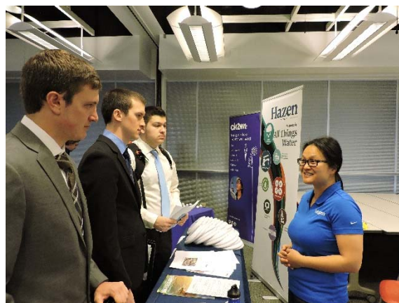
Environmental Engineering and Water Resources Networking Event, March 2017

Once the Office of Admissions has completed its evaluation, the student will meet with the EVEN Advisor for evaluation of transfer credits for the EVEN curriculum. Note that acceptance of transfer credits by the admissions office does not ensure that the transfer credits will count toward the EVEN BS degree; courses taken at another institution must match the course requirements for the EVEN curriculum. In many cases, identification of courses is straightforward; however, for some courses, the EVEN Director may request documentation of course content (catalog descriptions, course syllabi).