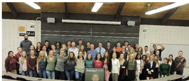
EVEN Senior Design Class of 2017

The Environmental Engineering Program is cooperating with the Department of Civil, Environmental, and Architectural Engineering to offer concurrent EVEN BS/CVEN MS degrees in a five-year curriculum. The purpose of the concurrent EVEN BS/CVEN MS degrees is to allow capable students to gain greater depth of knowledge in environmental engineering by jointly pursuing BS and MS degrees. The concurrent degree program offers students greater flexibility in scheduling technical electives and graduate courses.