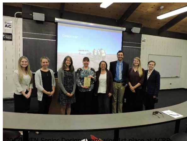
2017 EVEN Senior Design Team wins 1st place at ACRP Competition