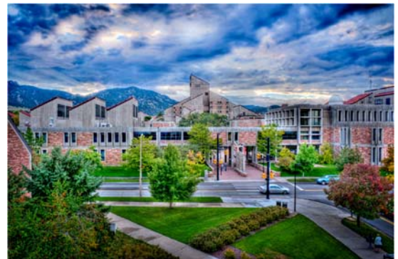
The Engineering Center at the University of Colorado at Boulder.

To address these challenges, environmental engineers often encounter challenging problems that must be solved in data-poor situations as members of multidisciplinary teams. Environmental problems require creative solutions with contributions from scientists, lawyers, business people, and the public. Good communication skills, as well as technical proficiency, are essential for success in this arena. In addition, technology designed to address environmental problems is marketed globally, opening up increasing opportunities for international work in the environmental engineering field.