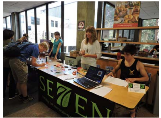
SEVEN, Society of EVEN is a resource for engineering students to connect and explore applications of environmental engineering