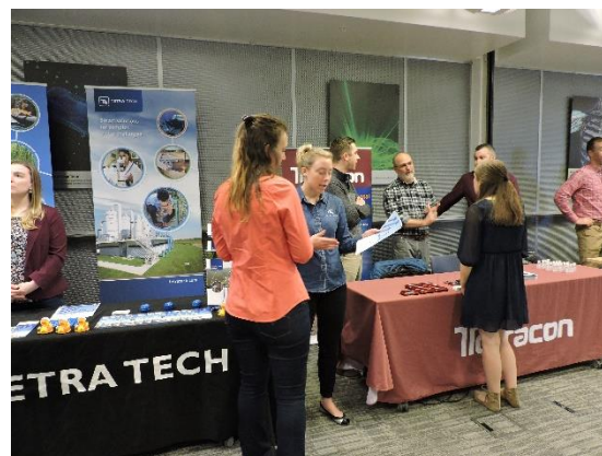
Environmental Engineering and Water Resources Networking Event, February 2019

Once the Office of Admissions has completed its evaluation, the student will meet with the EVEN Advisor for evaluation of transfer credits for the EVEN curriculum. Note that acceptance of transfer credits by the admissions office does not ensure that the transfer credits will count toward the EVEN BS degree; courses taken at another institution must match the course requirements for the EVEN curriculum. In many cases, identification of courses is straightforward; however, for some courses, the EVEN Director may request documentation of course content (catalog descriptions, course syllabi).