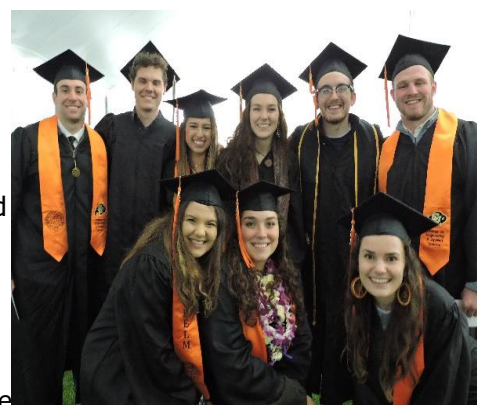
EVEN Graduation - May 2019

Graduation will be postponed by failure to complete these requirements. Any exceptions to these requirements will require approval of the Environmental Engineering Program Director and the Dean's office by petition. In addition, students must be recommended for graduation by the faculty of the EVEN Program and the faculty of the college, and should complete the senior survey.