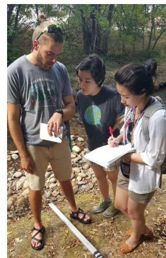
EVEN 4100: Ground Water Sampling, Fort Collins, CO.

Courses not listed in the curriculum may be used to satisfy prerequisite and co-requisite requirements if transfer credit or a petition to the Environmental Engineering Program has been approved. College of Engineering and Applied Science petition forms for this purpose may be obtained from the Academic Advisor or online .