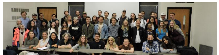
EVEN Senior Design Class of 2019

Colorado residents should be aware that the College Opportunity Fund (COF) may not cover all tuition costs associated with a double degree program (those beyond 145 semester credit hours).