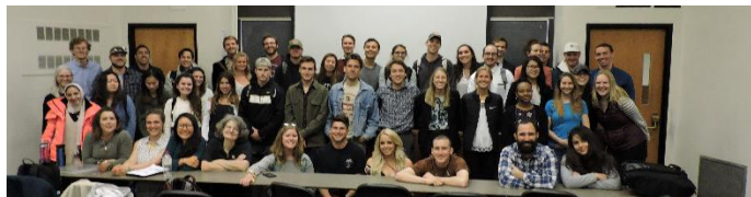
EVEN Senior Design Class of 2019

Colorado residents should be aware that the College Opportunity Fund (COF) may not cover all tuition costs associated with a double degree program (those beyond 145 semester credit hours).