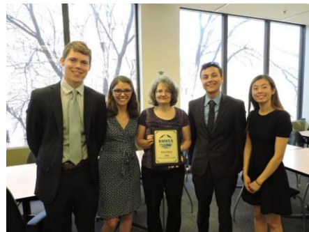
2019 EVEN Senior Design Team wins 1st place First Place at RMWEA Student Design Competition