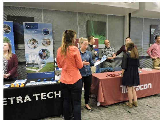
Environmental Engineering and Water Resources Networking Event, February 2019

Once the Office of Admissions has completed its evaluation, the student will meet with the EVEN Advisor for evaluation of transfer credits for the EVEN curriculum. Note that acceptance of transfer credits by the admissions office does not ensure that the transfer credits will count toward the EVEN BS degree; courses taken at another institution must match the course requirements for the EVEN curriculum. In many cases, identification of courses is straightforward; however, for some courses, the EVEN Director may request documentation of course content (catalog descriptions, course syllabi).