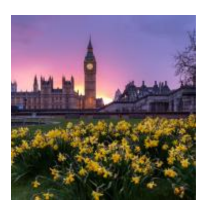
ENGL 3164: History & Literature of Georgian Britain