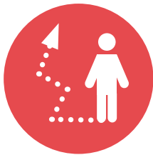
Chart Your Career Path