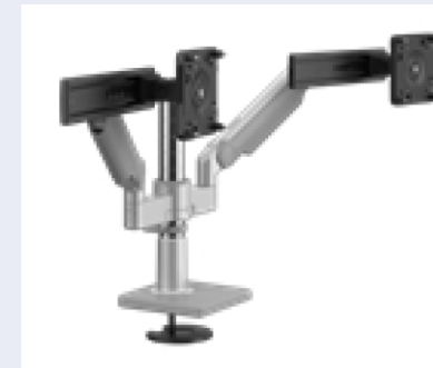
HUMANSIZE MFLEX DUAL MONITOR ARM FOR M2.1 $475.38

LEAD TIME: 4 weeks from order placement.