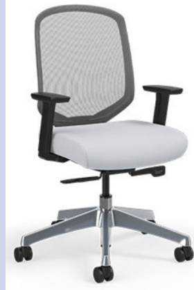
KI Diem Task Chair $402.99