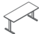
Two Leg T Foot