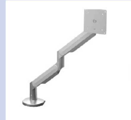
Agility Monitor Arm $129.86