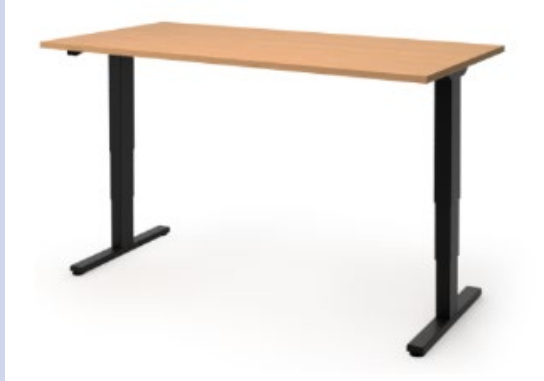
Apollo Table (24x60) $476.01