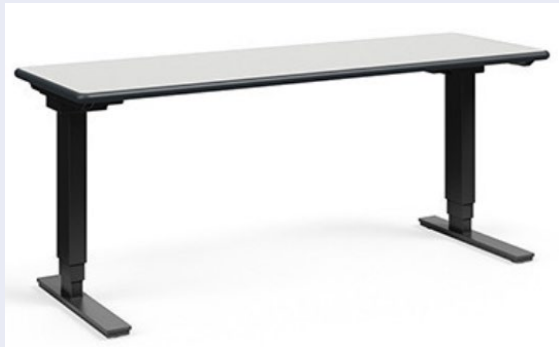
KI Toggle Table (24x60) $1069.32

LEAD TIME: 4 weeks from order placement.