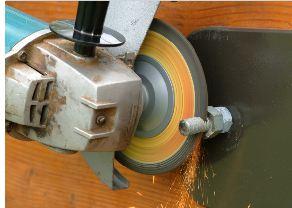
Ring test new or potentially damaged wheels.