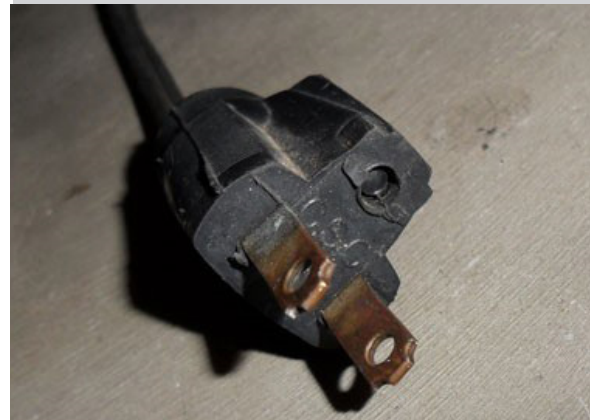
Do a pre-use inspection for damage.