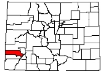
San Miguel County in Colorado

Mountain Village was developed to resemble a European alpine community (like Zermatt), just south of Telluride ski area's 1,700 acres. It was first developed as a Planned Unit Development in San Miguel County, adjacent to Telluride. It was incorporated as its own Town in 1995. The Mountain Village Core is a pedestrian-friendly area, which is linked to Telluride by the only free gondola system in North America serving over 2 million riders per year. The gondola serves as the main transportation vehicle between the communities (an easy 12-minute commute between them), and services all the ski slopes of both communities.