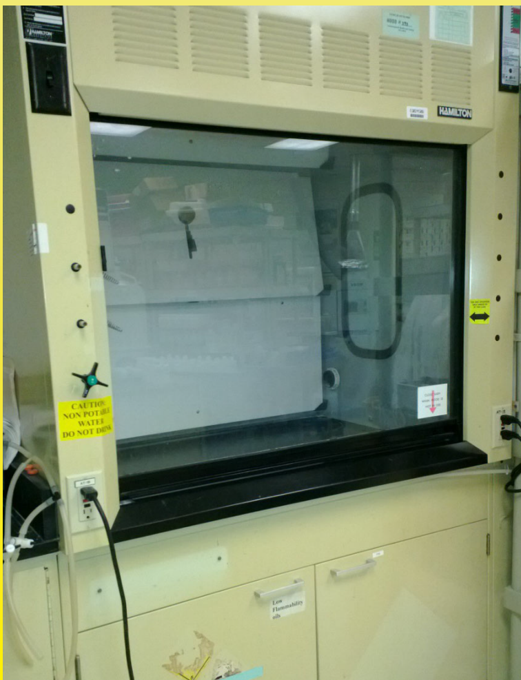
CAV-Constant Air Volume

Are there underutilized hoods in your department that can be made available to others?