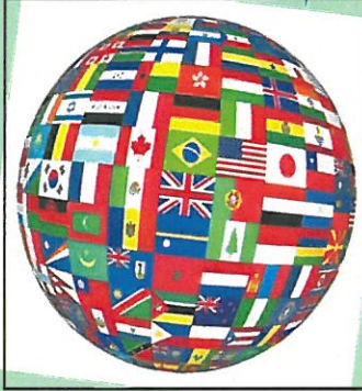
Cultural anthropology is the study of human cultures living today.