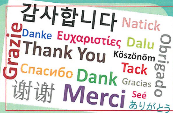
Linguistic anthropology is the study of language in human culture.

Hidden in this word search are five words that relate to anthropology. Find and circle the words in the word search AND find and circle the words in the captions beneath each picture above.