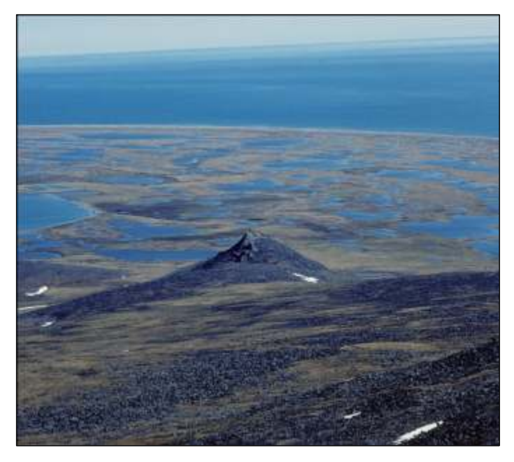
Cape Prince of Wales, from Cape Mountain

Location of the study area on the tip of the Seward Peninsula on the west coast of Alaska.