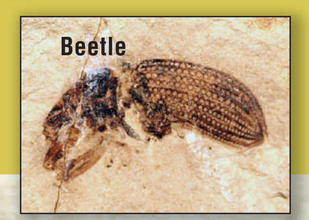
Mesozoic 65.5-251 million years ago