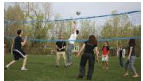
Another year-end celebration: the annual Hellenists-versus-Latinists volleyball game at the spring picnic. The Hellenists won this year in an epic five-game battle.