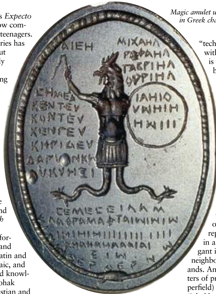
Magic amulet with Hebrew inscription in Greek characters

The course is designed to show how widespread the practice of magic was