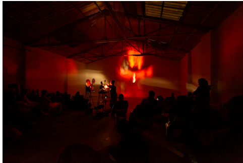
The evening concludes with PATH OF TOTALITY , a live projector performance restaging the August 2017 solar eclipse and bringing the cosmic into the confines of a projection Space.