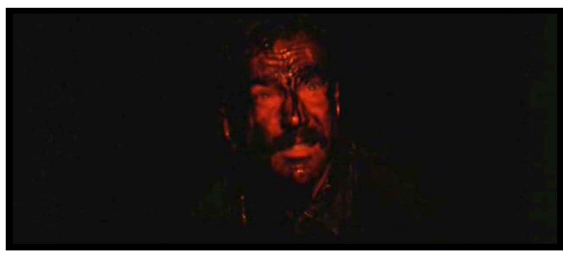
Fig. 3.1 Daniel Plainview illuminated in the flames of burning his oil rig