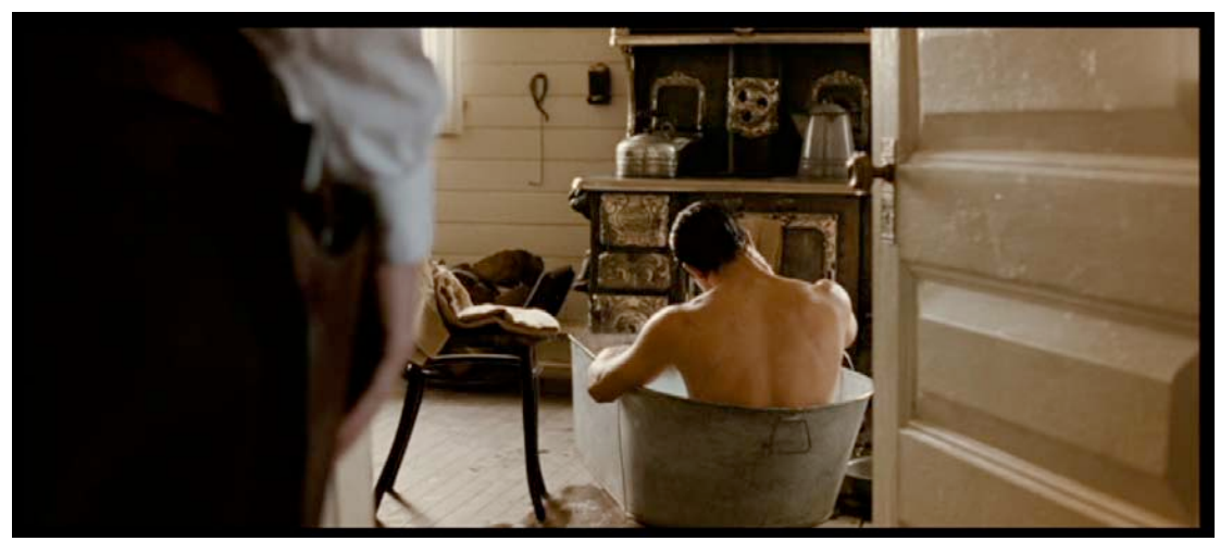
Fig. 4.1 Bob Ford watching Jesse James bathe.