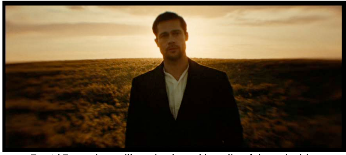
Fig. 4.3 Foggy vignette illustrating the mythic quality of cinematic vision