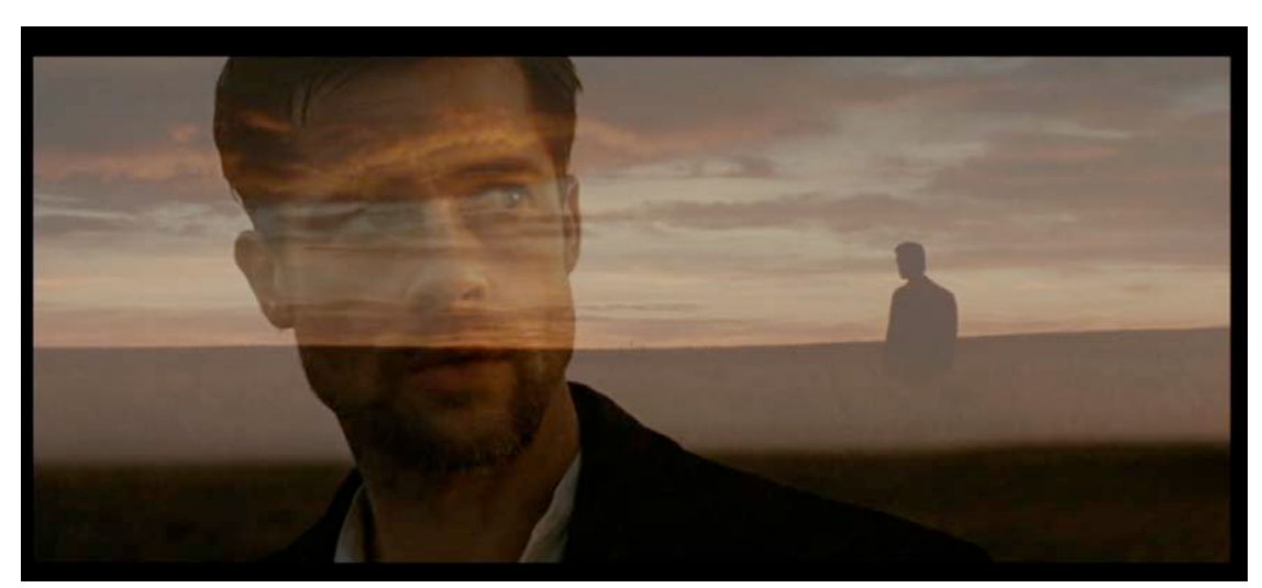
Fig. 4.2 Jesse James crossfaded into grand landscape shots