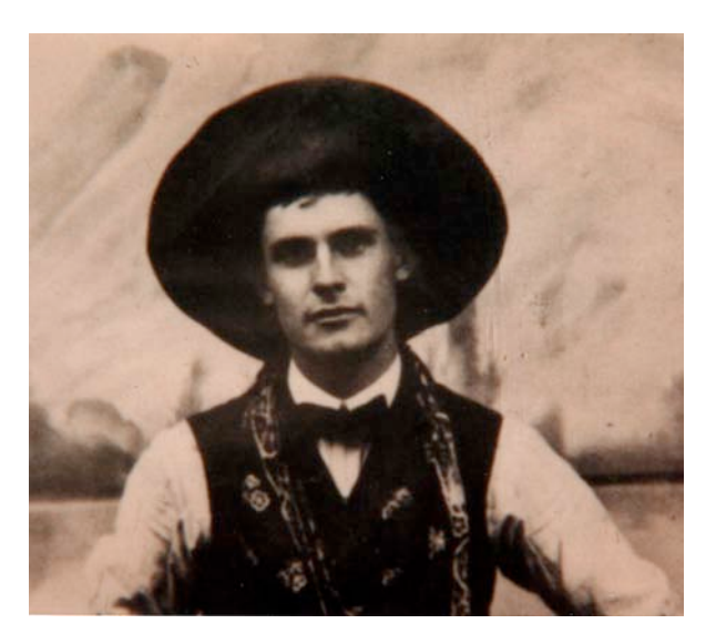
Fig. 1 The Unknown Cowboy

captured my imagination. I stole it from the page and taped it to my wall next to photographs of my friends, as though a trophy from my past. This photo contains the face of a man whose name my family doesn't even remember. He has a severe jaw line and dark hair, and is simply clad in what appears to be Mexican gaucho ensemble, with a wide-brimmed cowboy hat. He is the spitting image