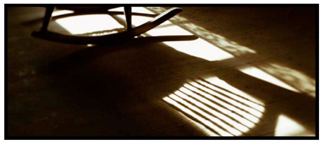
Fig. 4.4 Shadows as symbolism for cinema