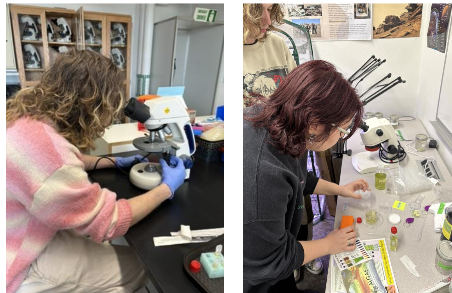
Figure 1. Setting up materials and checking under microscopes

We were unable to see any evidence of the tardigrades consuming the microplastics or of their digestive tracts glowing. We were able to see multiple rotifers' stomachs glowing under the UV light. The brine shrimp did glow, as expected.