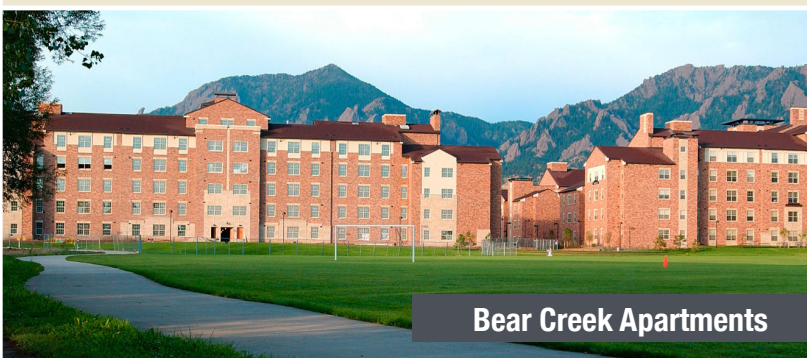
Bear Creek Apartments