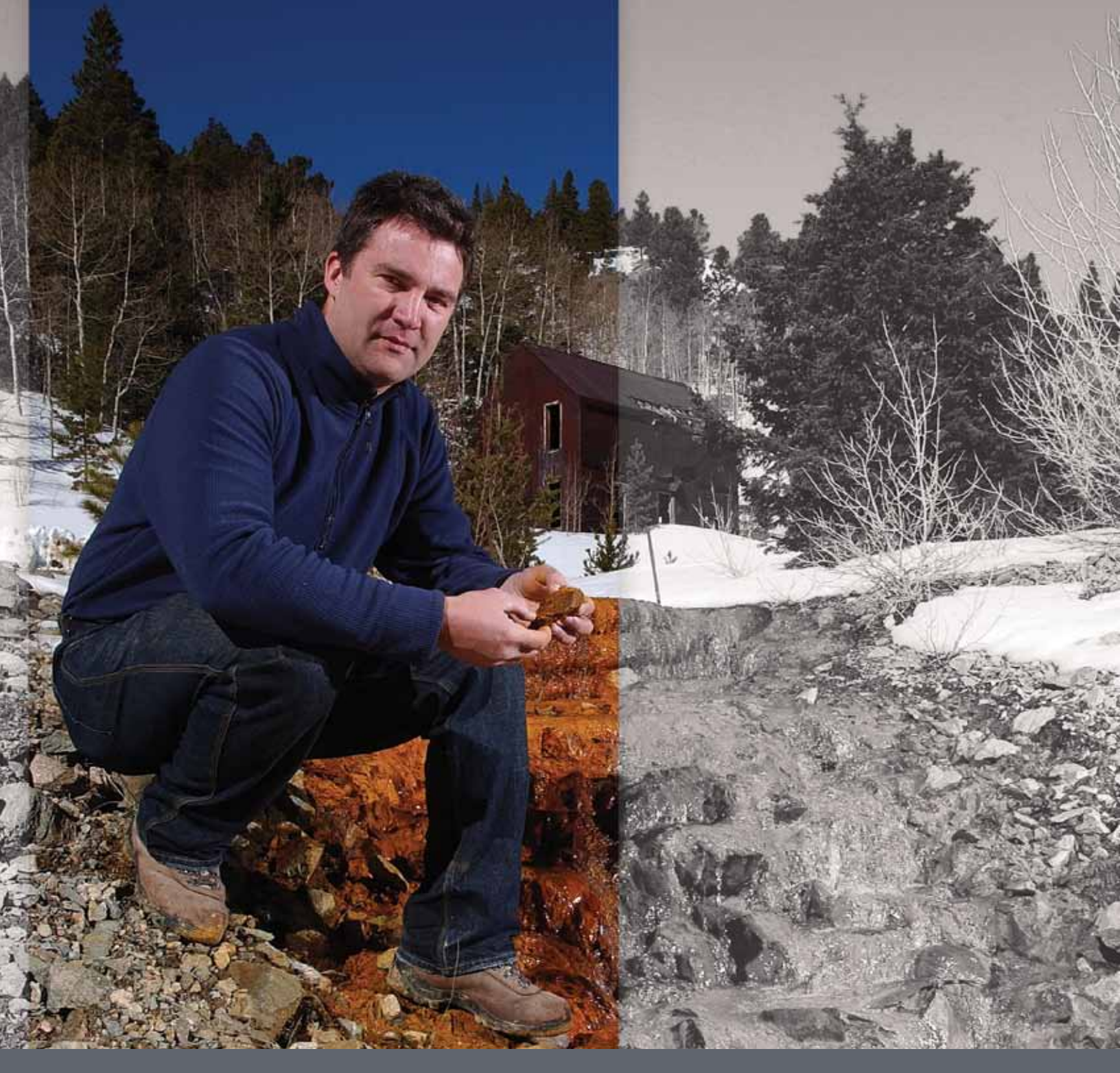
Civil, Environmental, and Architectural Engineering | University of Colorado Boulder