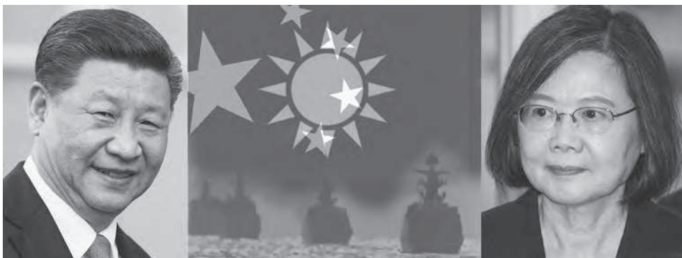
Chinese President Xi Jinping. Taiwan President Tsai Ing-wen.

Mao Zedong led to their retreat to Taiwan, where they established the ROC government. Meanwhile, the Communist Party formed the PRC on the mainland. This unresolved conflict between the KMT and Chinese Communist Party (CCP) still troubles the current status of Taiwan and its efforts toward territorial independence. 7