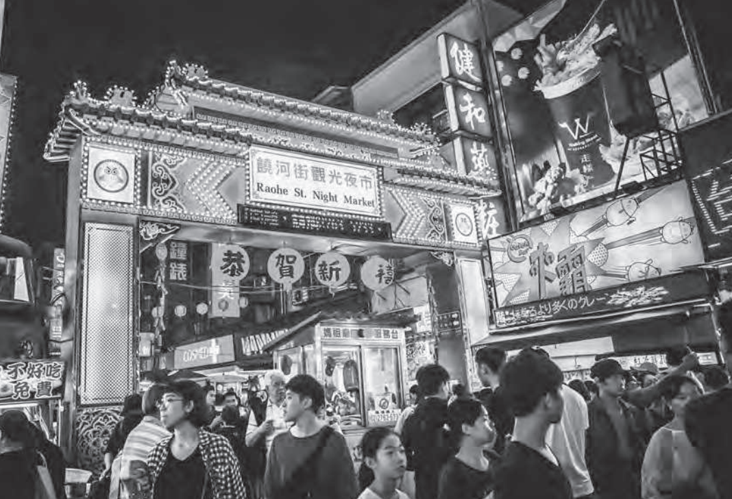
The Raohe Street Night Market is one of the oldest night markets in Taiwan.

Over the three weeks we were in Taiwan, students observed, documented, and analyzed a wide range of urban spaces, buildings, landmarks, and people to develop a deeper understanding of the city's physical and social fabric.