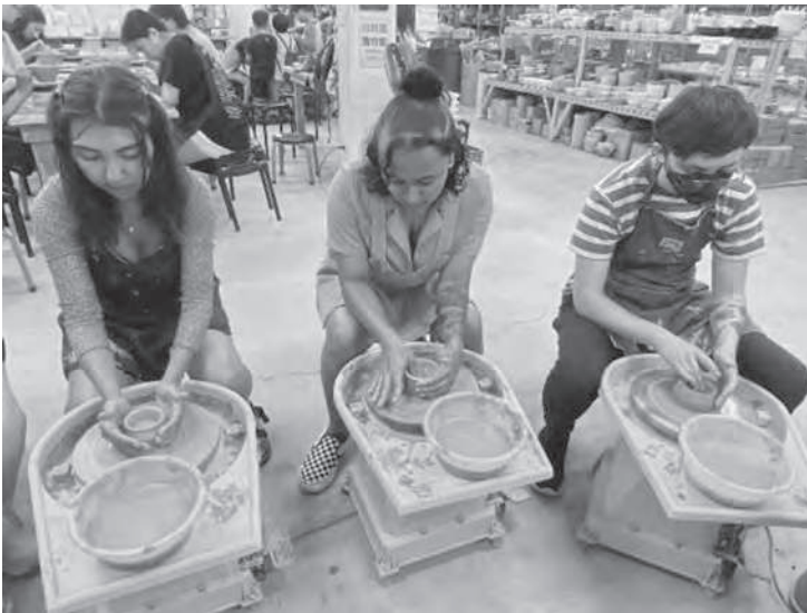
Students making ceramic bowls and cups in Yingge.

of their learning than they likely do in a classroom back home. These kinds of improvisational experiments such as having students take over pieces of the itinerary and the teaching (through experiential activities) have helped me personally build trust in the process of teaching with a “beginner’s mind” that has continued to inform my teaching in all my courses. These types of activities, including the subsequent debrief and reflections, also allow for metacognitive work for all of us in discovering our thinking and ideas have changed as a result of our time experiences.