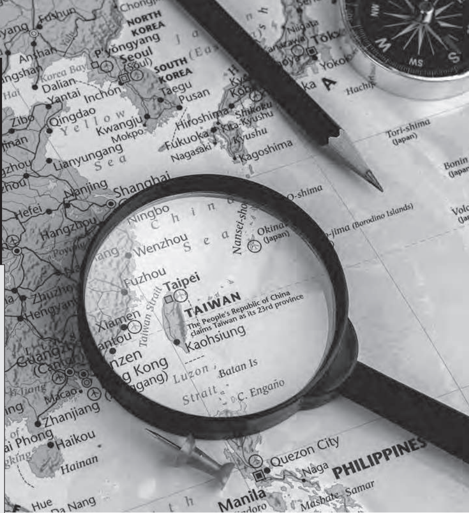
Taiwan under the magnifying glass.

O ne of my favorite undergraduate courses to teach is Memory and the Politics of Heritage in Asia . This class uses examinations of material objects (not only museums, monuments, and memorials, but also archives, school curriculum, and oral histories) to explore how history does not exist as a passive, fixed account, but is instead an active and ongoing struggle to shape narratives, preserve memory, and influence collective consciousness. In this class, we explore history as a living, contested terrain. 1 However, it can be difficult for undergraduate students sitting within the four walls of my classroom, place-bound on my campus, to truly feel how competing narratives of history are actively being contested and fought over in real time as we study them. For this reason, when I had the opportunity in the summer of 2023 to take a group of undergraduate students to Taiwan on a faculty-led program to explore memory politics there in real-time, I immediately agreed. In my experience, there is nothing more powerful to understanding memory politics than taking students to the physical spaces where history has taken place and is actively being remembered, suppressed, and shifted.