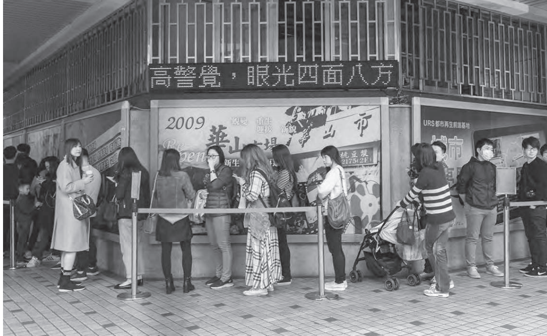
A long line of customers at Fu Hang Soy Milk in the Huashan Market Building, Taipei, Taiwan.

The first group led us on an early morning food tour of Taipei, introducing us to classic Taiwanese breakfast items including doujiang (warm soybean milk), luobogao (turnip cake), danbing (Taiwanese egg wraps), congyoubing (scallion pancakes), and youtiao (fried crullers). When the activity began, we first stopped at a local soy milk stand to get drinks, and then proceeded together to a local park where the group delivered a brief lecture on the origins of each of these dishes and how they had made their way to Taiwan. They split us into small groups to discuss how food shaped our own identities and reflect on what the origins and stories of these dishes added to our understanding of what it means to be Taiwanese. For our final stop, we feasted on the fried crullers at the Michelin-starred Fu Hang Soy Milk, getting to also experience the forty-minute wait snaking down two flights of stairs into the street, common to any trendy dining establishment in Taiwan.