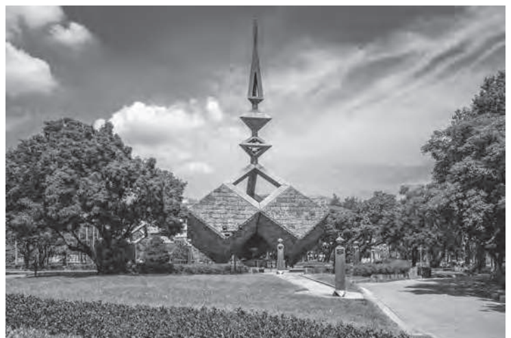
Massacre Monument at 228 Peace Memorial Park located in Taipei.