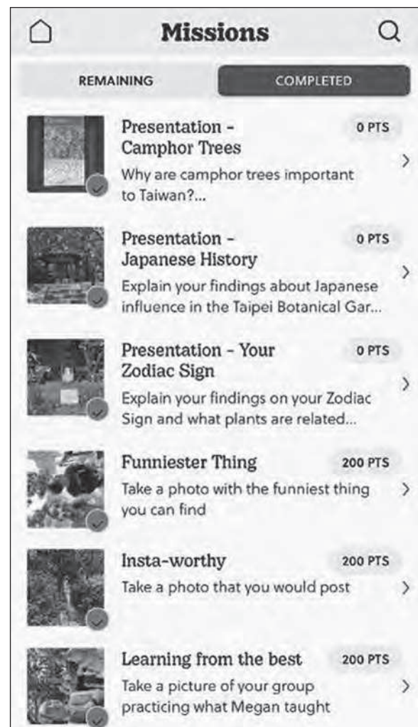
A Screenshot showing some of the tasks required of scavenger hunt teams in GooseChase.

This experiential learning project centered around the idea of “reading the city,” and student participation as partners provided a unique and immersive learning experience for undergraduates. Through a grounded exploration of the city of Taipei, students witnessed firsthand how different stakeholders were invested in telling their own histories and stories through public spaces. These included the rainbow crossing right outside Exit 6 of Ximen Metro Station celebrating the local