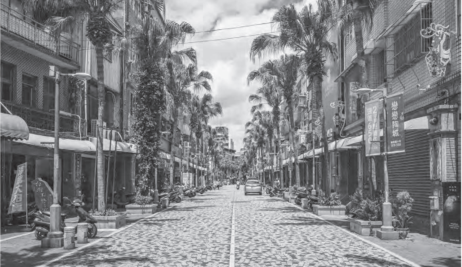
Yingge old street, aka the Pottery Street or Ceramics Street, located at Yingge town, New Taipei City, Taiwan, is famous for the over 200 year history of pottery craftj.