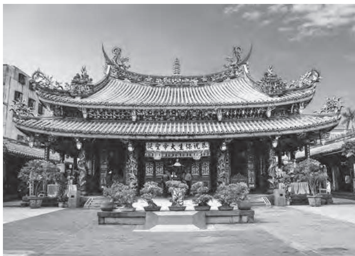
Dalongdong Baoan Temple in Taipei.

Over the three weeks we were in Taiwan, students observed, documented, and analyzed a wide range of urban spaces, buildings, landmarks, and people to develop a deeper understanding of the city's physical and social fabric.