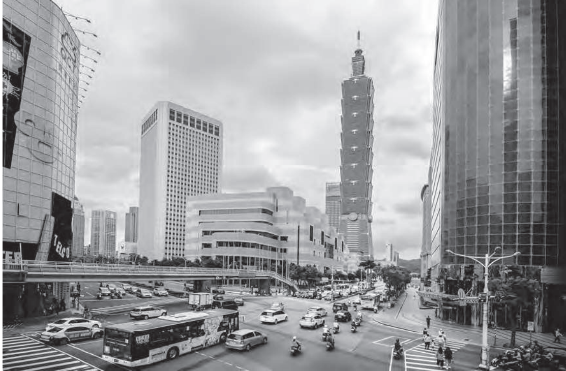
View of a busy street corner in downtown Taipei City.

Before leaving, students conducted preliminary research on the history, memory politics, and significant events related to our itinerary and their areas of interest to prepare for the trip. However, since the course did not officially begin until the summer term, we were limited to four hours of meeting time together over two sessions held one month before the trip. Once we arrived in Taiwan, rather than a standard guided tour, we utilized public transportation and our feet to