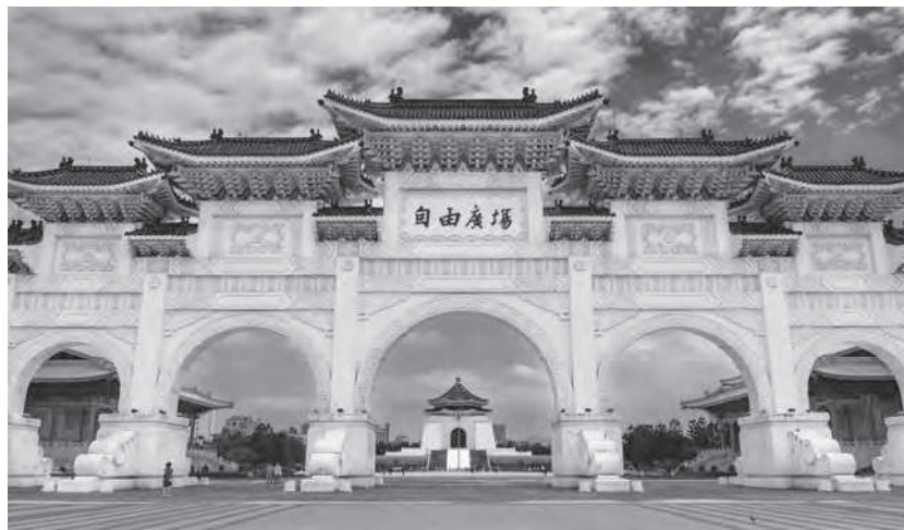
Chiang Kai-Shek Memorial Hall.