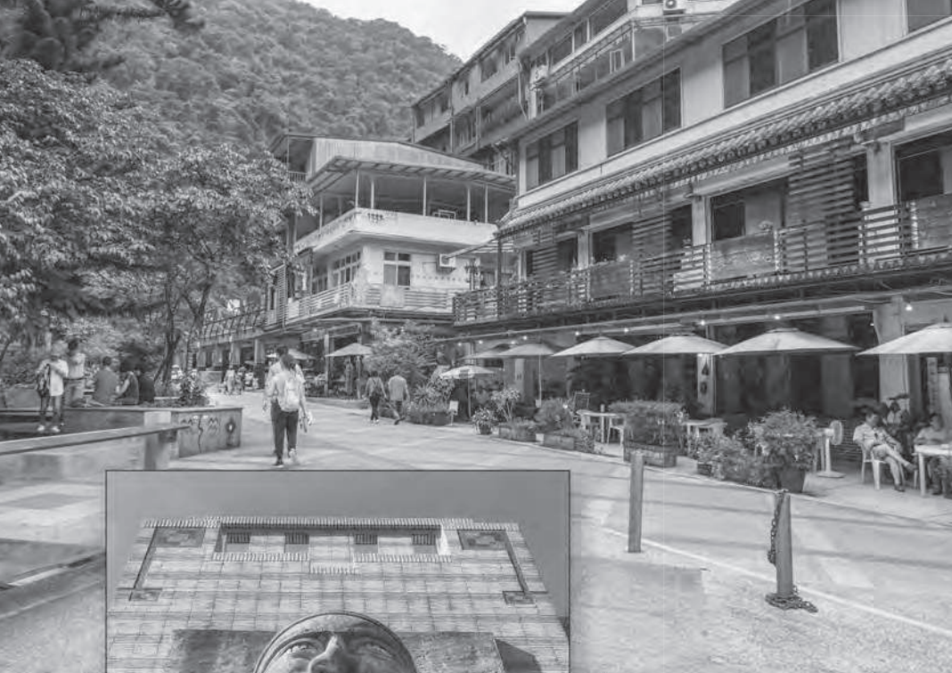
Wulai village.