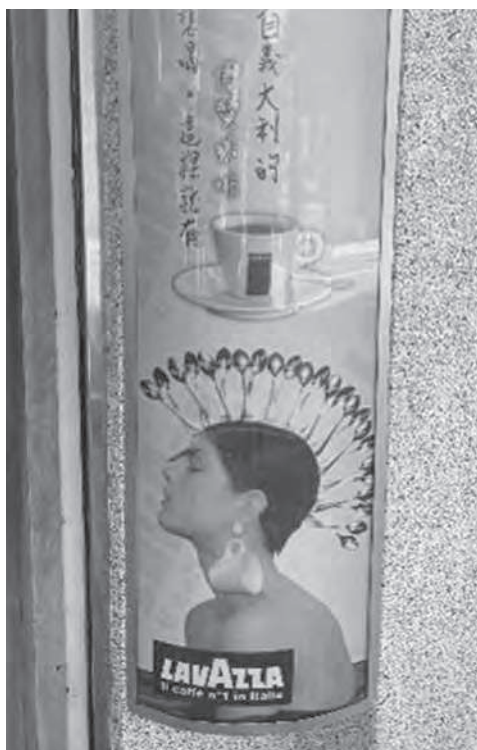
An arguably problematic image of Italian coffee brand Lavazza advertisement outside of a local café in Wulai.

Reflecting on getting back to organizing summer faculty-led programs in Asia, I want to emphasize how important it is to remember that in these kinds of experiential, high-impact programs, our responsibility as teachers is primarily to facilitate student learning, which often means not to deliver information ourselves or to lecture. Instead, it is to help set up experiences where students can discover the place we are in on their own. We are there to help them make meaning of it (not make the meaning for them) and give them the space to take more control