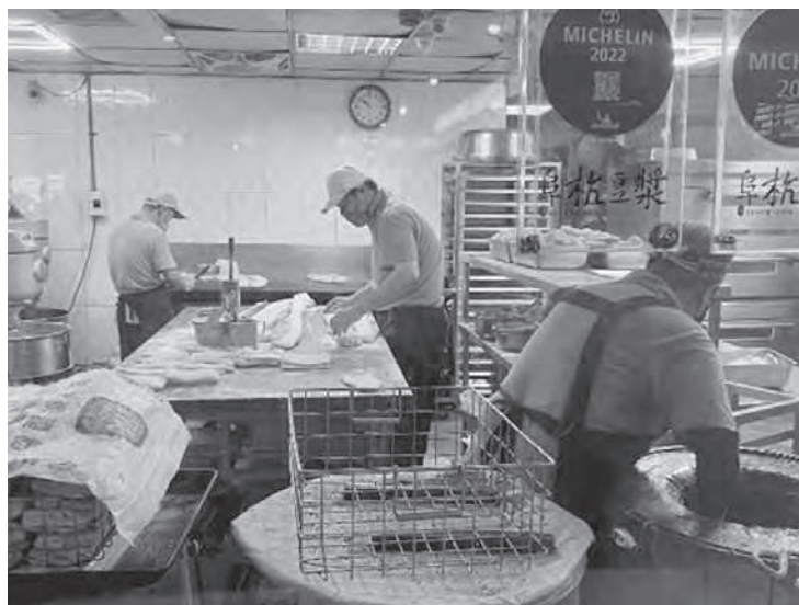
Fried cruller chefs hard at work at Fu Hang Soy Milk.