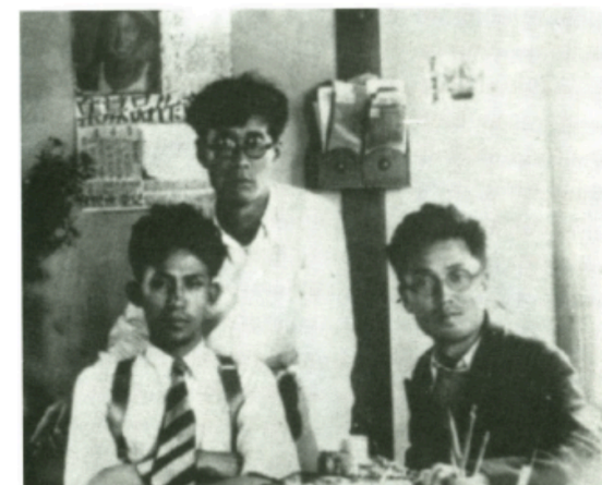
Yi Sang (seated, left), novelist Pak T'ae-wŏn (standing), and writer/translator Kim So-un in the editorial office of Adong segye [Children's World]

In this seminar, we will read canonical short fiction and poetry from the 1900s to the 2000s. You will also gain an overview of modern Korean socio-cultural history. No prior knowledge of Korean language or Korean culture is required. Taught in English.