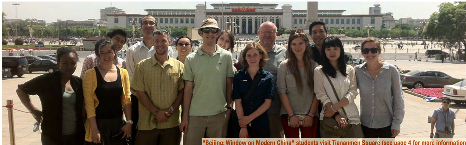
"Beijing: Window on Modern China" students visit Tiananmen Square (see page 4 for more information)