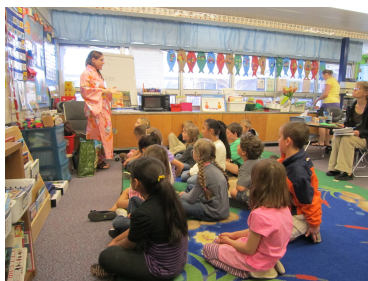
IESP intern teaches a class of Boulder-area first graders about Japanese culture.