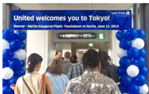
Signs at Narita International Airport welcome the delegation from Denver to Japan, marking the end of the inaugural direct flight.