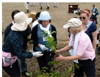
Fulbright participants help plant trees on a beach devastated by a tsunami.