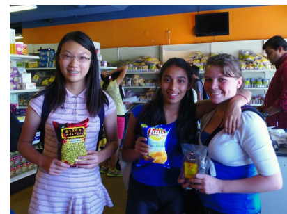
STARTALK students apply their language learning by shopping in a local South Asian market.