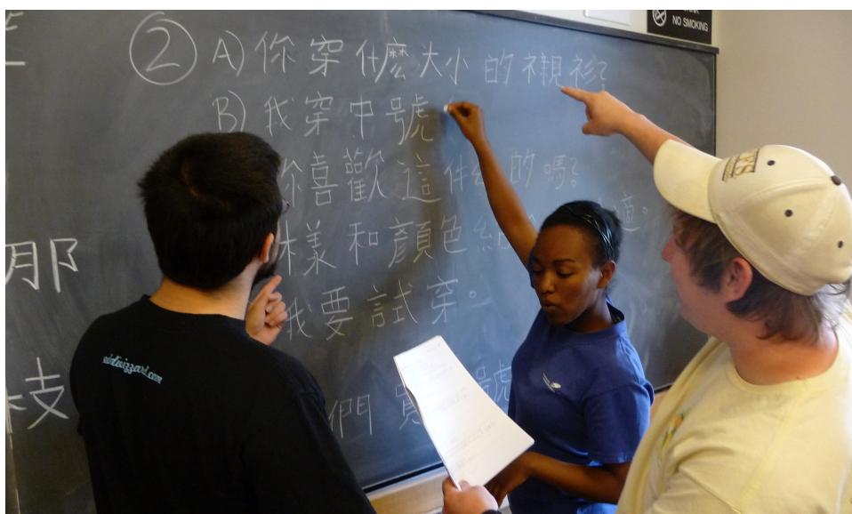
Students in a Chinese language course. CU students can choose from among six Asian languages offered in the Department of Asian Languages and Civilizations: Arabic, Chinese, Farsi, Hindi, Japanese, and Korean.

CAS is excited about the new minor degree and anticipates welcoming many students aboard in upcoming semesters. For more information, visit cas.colorado.edu/content/asian-studies-minor .