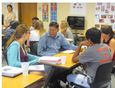
High school students study Hindi and Urdu at CU in Summer 2013 through STARTALK.