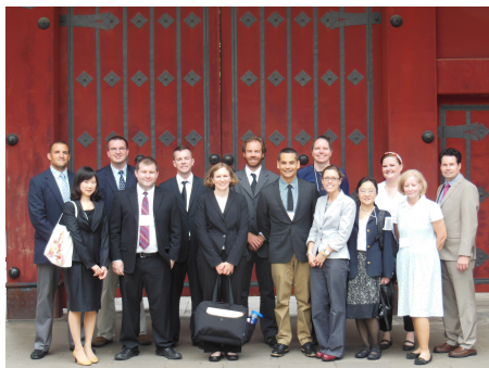
Fulbright participants pose for a picture while attending meetings during the month-long Fulbright seminar in Japan.

A long-term goal of this STARTALK program is to foster the development and successful implementation of Hindi and Urdu language in the K-16 curriculum in Colorado. Parents, educators, and local community organizations play a critical role in that endeavor and we actively involve them in the program. We collaborated with educators at Alexander Dawson School; Fairview High School; and Bal Vihar, a local Indian community after-school program. Within the CU community, we worked with faculty in the Department of Asian Languages and Civilizations and the Anderson Language Technology Center, with guest speakers from History and Anthropology. The program will be offered again in summer 2014. For more information, visit http://cas.colorado.edu/content/startalk-hindi-rockies .