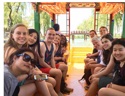
Recipients of the Tang Fund awards on the boat in Yuanmingyuan (Beijing) as part of the 2017 Urban China Global Seminar.

The students were extremely enthusiastic about the program and many of them said that being able to take the subways and get around on their own as well as with the group really boosted their confidence in their ability to negotiate an unfamiliar city where English was not the primary language. Most also commented on how much the course and the trip positively changed their perceptions of China. The combination of the course content with participation in everyday life in Chinese cities gave the students a more meaningful, in-depth experience and a higher level of intercultural competence—an asset that can enrich their lives and enhance their careers.