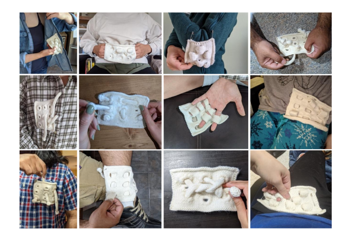
Figure 5: Examples of ways in which participants wore and interacted with the swatches during the study. Participants physically adapted the swatches to fit their bodies, certain interactions, and different contexts.

While we designed the swatches to afford a range of inputs and outputs, we were surprised by the different ways in which people