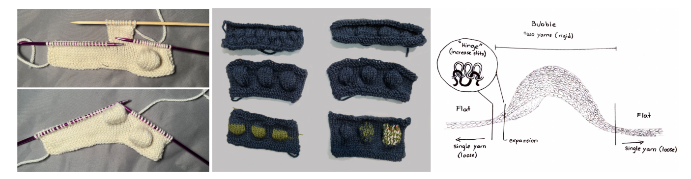
Figure 2: Our explorations making a deformable bubble structure: (left) exploring ways to shape knit a bulging structure using freeform knitting; (middle) experimenting with size, material, and structure; (right) making the structure reactive (giving a sensation of snapping or popping) by varying the tension in different places.

be achieved by knitting more tightly or loosely and by combining or introducing new loops and material. Differences in tension can bring about interesting material behavior as it makes the deformation space inhomogeneous. We noticed that areas knitted more tightly became stiffer and held their shape whereas areas knitted loosely remained slack and were drapable. Both areas could be deformed when acted upon, though shape-retaining structures could spring into new configurations or spring back into their original shape. By combining areas of high and low tension we were able to create reactive controls that could actuate (see Fig. 2).