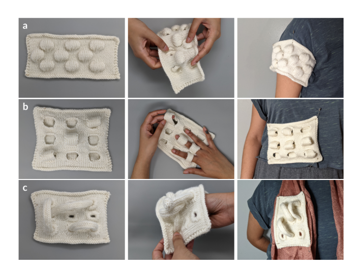
Figure 3: The three swatches that emerged from our design explorations: (a) bubble swatch, (b) stranded swatch, (c) corded swatch. Each swatch offers a range of interaction possibilities and body placements.

considerations of individual lived experiences [13]. Within speculative design, design probes have been used to provide context for ideas and to provoke experiential encounters of alternate futures that engage people at the emotional, physical, and sensorial (as well as intellectual) levels [35]. These experiential encounters are important for exploring how technology can fit meaningfully into people's lives. Our probes are speculative probes [4] which combine the investigative engagement of design probes [17] and the imaginative predictions of speculative design [13, 40]. In addition, our textile swatches, in their intriguing materiality and graspable transformability, offer a means of involving non-experts in envisioning future self-tracking technology and practices that have personal value.