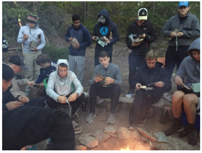
*Freshmen Cadets opening their first MRE's