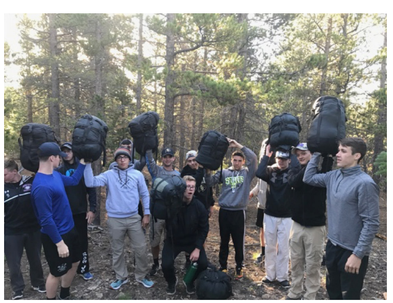
*For many of the freshmen, this was their first time sleeping in an Army issued sleep system