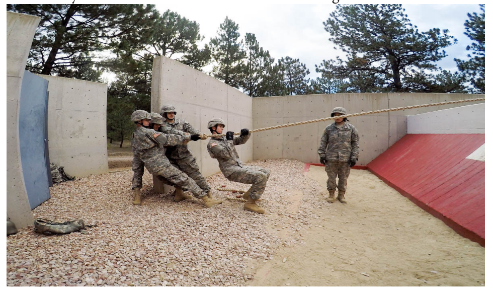
*Cadets exercising their critical thinking abilities during a Field Leadership Reaction Course

The Cadets began their Friday afternoon with day land navigation over a twelve kilometer course where they advanced their skills in dead reckoning and terrain association. Armed with only