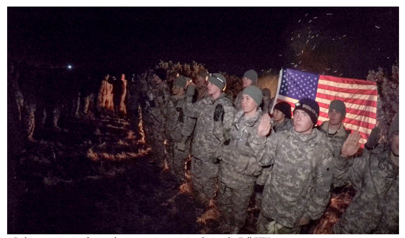
*Cadets swearing in after conducting evasion training during the Fall FTX

At 0100, when all of the Cadets arrived at the bonfire, LTC Roof swore in the newest contracted Cadets of the Golden Buffalo Battalion. This provided every Cadet with an extremely memorable experience for Fall FTX.