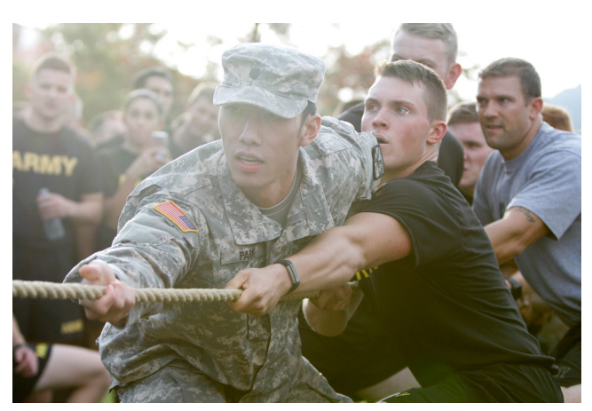
*Army Cadets lining up for the tug-of-war