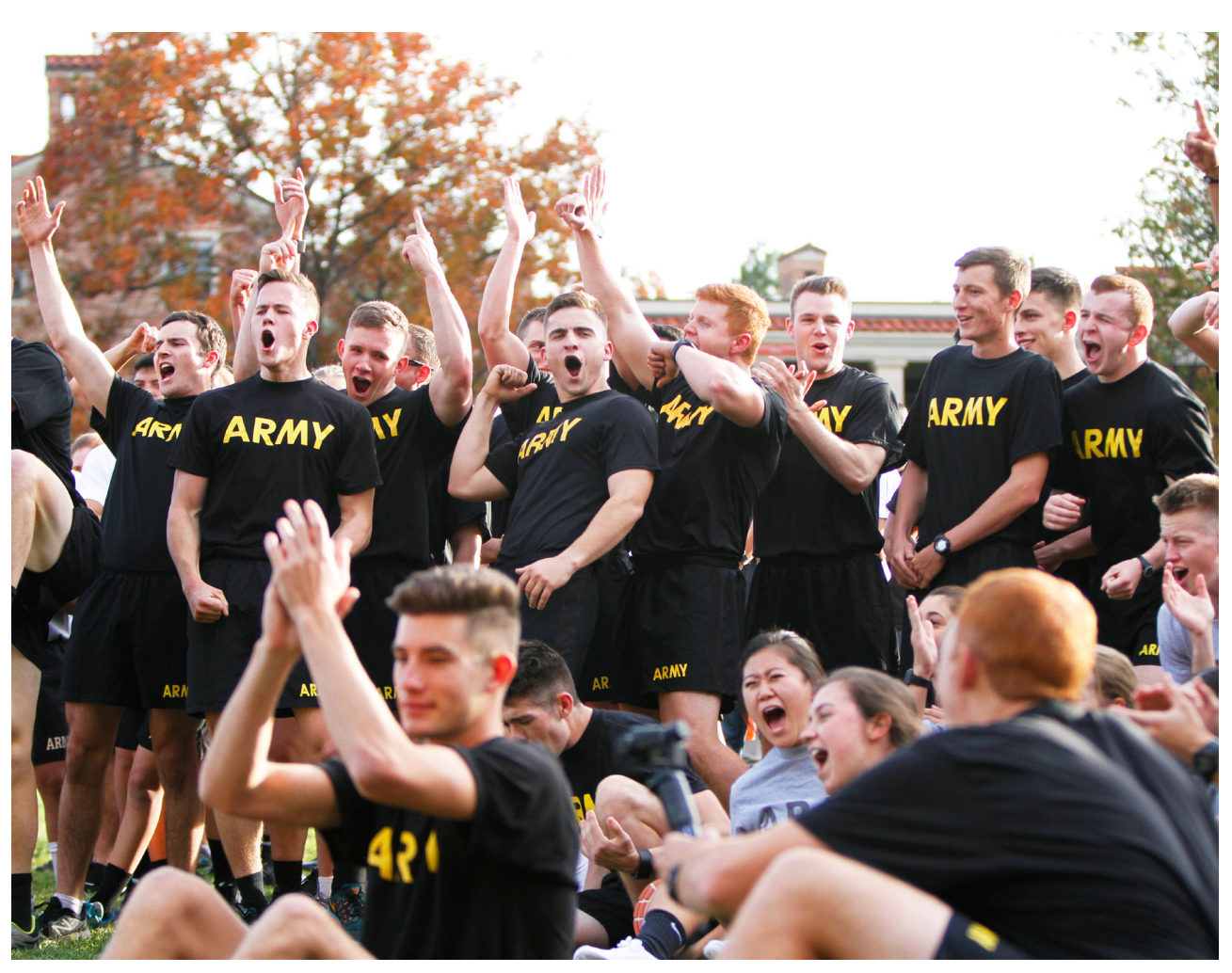
*A photo taken at the moment the Army Cadets were announced as the winners