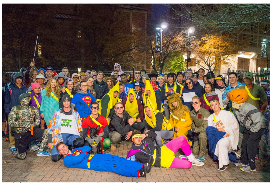
*Alpha Company group photo after final formation

The morning of October 31st marks one of the few mornings that Cadets are excited to wake up to the 0445 alarm. At Alpha Company, the Cadets fall into formation sporting their best costumes. A few are designated as the "zombies," And at signal, "GO," Cadets scatter to hiding spots around campus with the "zombies" right on their tail. Once tagged, the Cadet becomes a zombie. After 45 minutes in hiding, the best hiding spots are called to make their attempt back to the buffalo statue outside of Folsom Stadium.