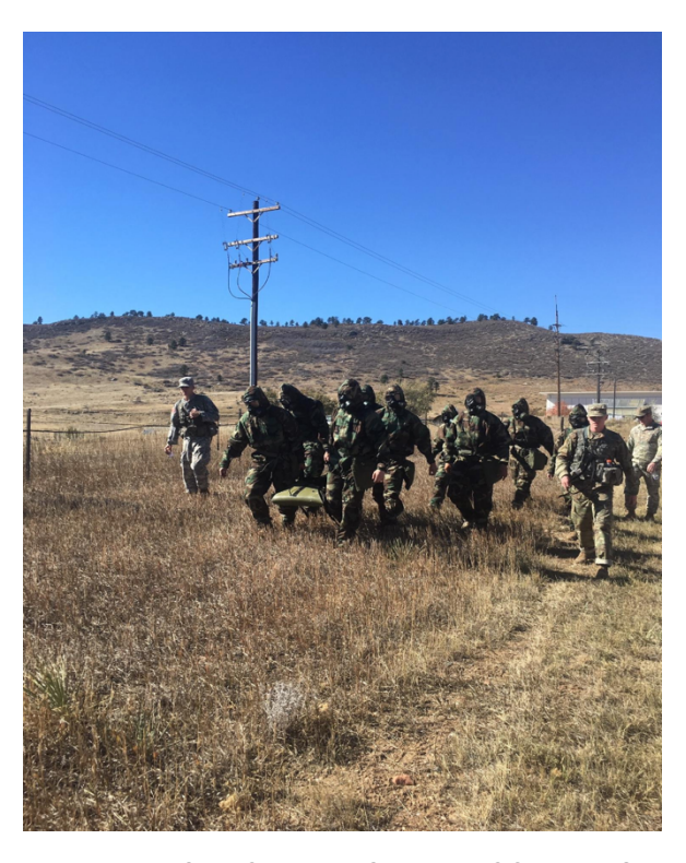
THE RANGER CHALLENGE TEAM COMPETES IN THE CBRN LANE IN FORT COLLINS, CO.

the Golden Buffalo Battalion plowed ahead, making short work of rescuing a convoy hit by an IED, executing a call for fire, and evacuating a downed pilot, despite the snow and freezing rain. Sunday morning, Cadets braved 20 degree temperatures for a swearing in ceremony in the billowing snow: a fitting start for future officers from Colorado. Our unit demonstrated perseverance and proficiency throughout the weekend, and the training we conducted fostered confidence and teamwork that will serve us well throughout our time in ROTC and the Army.