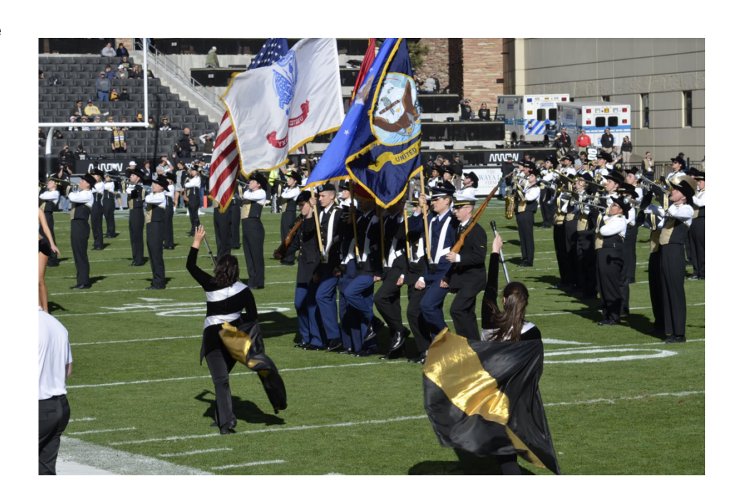
CADETS PERFORM IN A JOINT COLOR GUARD AT THE CU FOOTBALL MILITARY APPRECIATION GAME.

As future service members, it was an honor for every Cadet who participated in this Military Appreciation game to pay homage to our veterans, and is an important reminder of why they signed up to serve the United States.