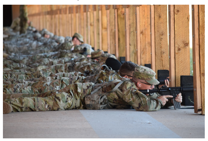
CADETS SPEND TIME ON THE RANGE ZEROING IN RIFLES AND PRACTICING SHOOTING BASICS

The Cadets of Charlie Company had the opportunity to participate in several events that provided funding for the battalion. The highlights of volunteering were the Boys and Girls Club where Cadets spoke to club members about ROTC and its benefits. They also enlightened the members about college life and how to apply for college and choose a degree. Charlie Company's Cadets helped the locals build their trails during an event in Nederland. Metropolitan State University instructed incoming freshmen on what ROTC entails by directly speaking to upper-level Cadets. Lastly, Charlie Company had the opportunity to present the flags at the Annual Tri-Institutional Veterans Day Celebration and a hockey game for the University of Denver.