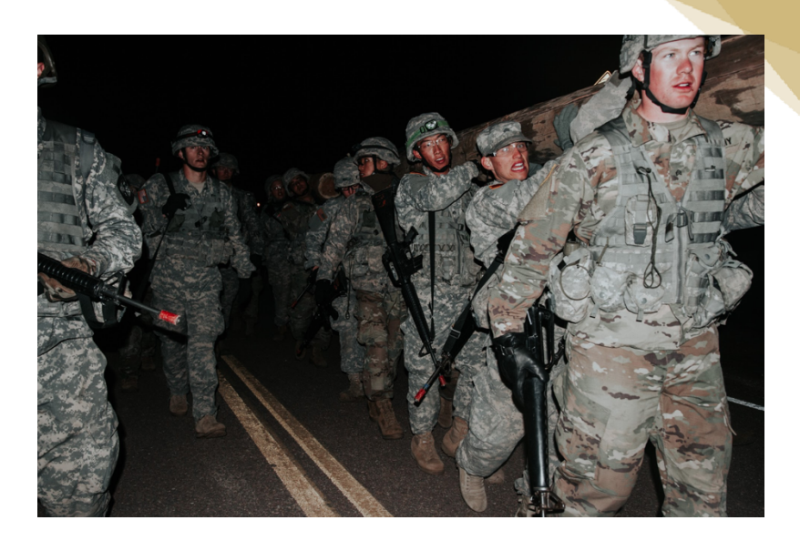
DURING THE FUNCTIONAL FITNESS LANE AT FALL FTX, CADETS WERE CHALLENGED IN MOVING OBJECTS LIKE LOGS, TIRES, LITTERS, AND EVEN TRUCKS AS A TEAM

The weather remained fantastic throughout the night in patrol bases and during the second day of activities, facilitating effective and fun training on the confidence, obstacle, and leader's reaction courses. As usual, the Buffs were lethal on the range. A cold wind drove in a storm for the night's exercises, but