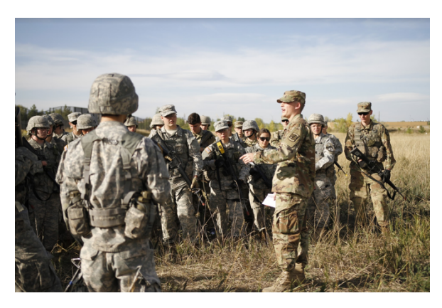
CADET WELSH BRIEFS ALPHA COMPANY ON A PLATOON COMPETITION DURING IMT LAB.