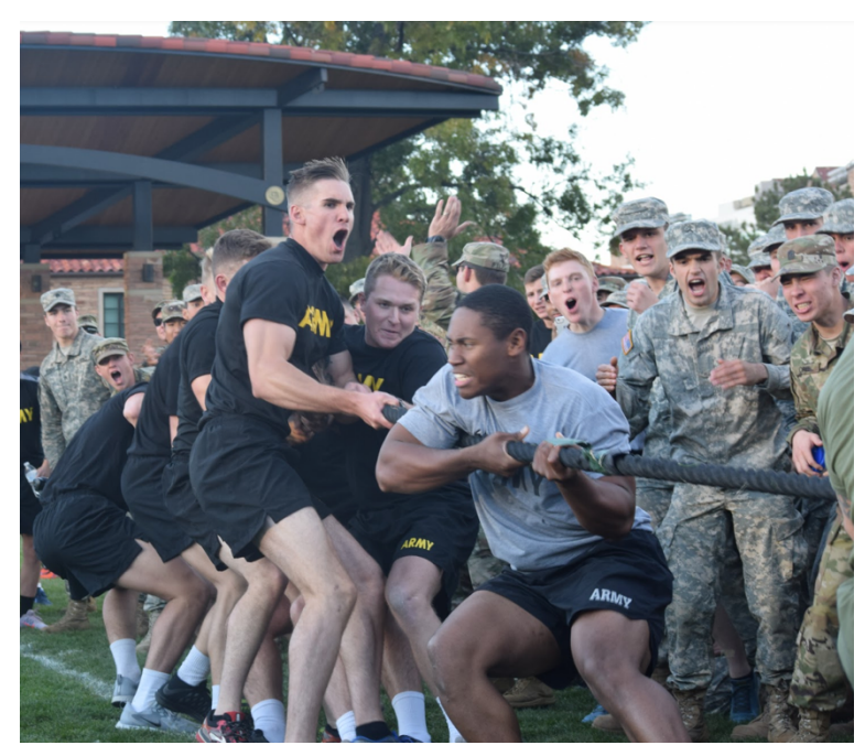
CADETS WIN THE TUG-OF-WAR EVENT AGAINST NAVY ROTC.

The annual Tri-Mil Service Competition took place October 18th on Farrand Field at the University of Colorado Boulder. Cadets from the Army, Air Force, Navy, and Marine Corps ROTC programs competed to win the competition and the coveted Tri-Mil trophy. Normally, the branches work together on campus to complete their training missions. This is one day out of the year where the different branches come together to battle it out in intense but friendly competition. A team from the Mexican Navy was also present, symbolizing the strong relationship between our nations' forces.