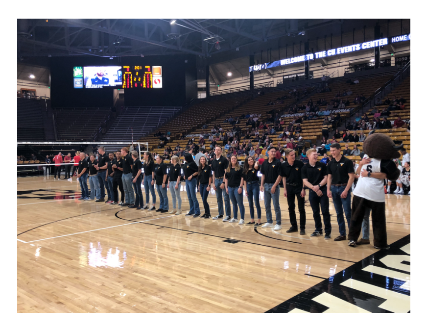
CADETS ARE RECOGINZED AT THE CU WOMENS VOLLEYBALL GAME FOR THEIR INVOLVEMENT IN ROTC.

After two intense sets of CU volleyball, the Cadets were lead out onto the court in a file and faced the west stands. It was hard to hear the applause and recognition with Chip the Buffalo having a good time, getting cozy with Cadets. This would be a theme for the night. Cadets settled back into their seats as CU led a valiant comeback from being down two sets.