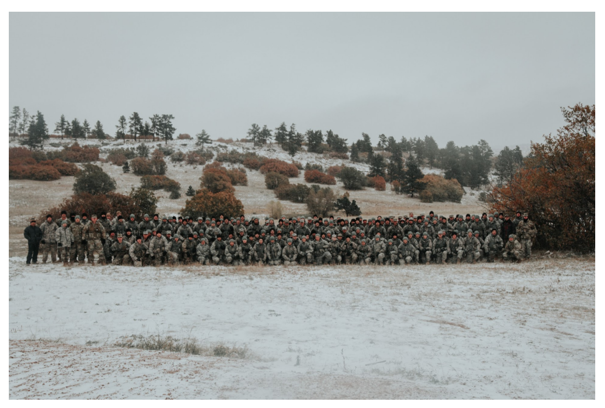
GOLDEN BUFFALO BATTALION PHOTO FALL FTX 2018

Although watching CU fall 3 sets to 1 against Washington State, the Cadets had a great time and fulfilled the commander's intent of representing the Golden Buffalo Battalion for the people of CU.