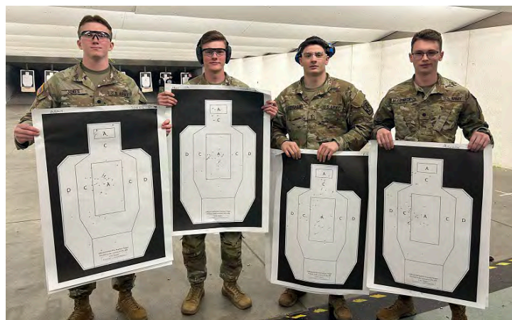
ARMY ROTC CADETS SHOWING THEIR RESULTS AFTER THE PISTOL COMPETITION AT THE NROTC COLORADO MEET.

https://www.colorado.edu/arotc/2024/03/08/participated-nrotc-colorado-meet-march-2024