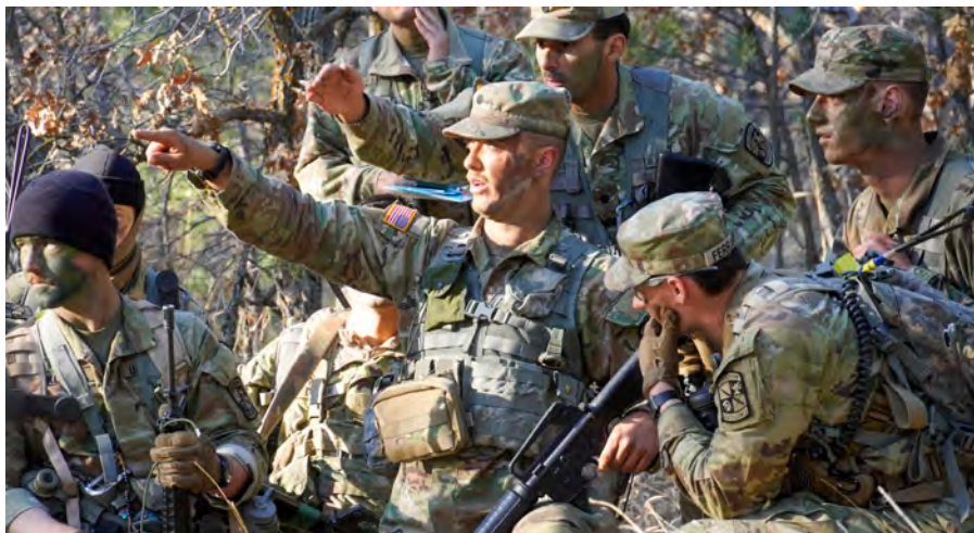
CADETS DISCUSSING POTENTIAL ROUTES TO TAKE TO SUCCESSFULLY TAKE THEIR SQUAD THROUGH THE PATROL BASE TRAINING LANE.

Once again, the Golden Buffalo Battalion Army ROTC Cadets traveled down to the Jack's Valley Training Area on the grounds of the U.S. Air Force Academy to conduct their annual spring Leader Development Exercise (LDX) on Thursday, April 11 through Sunday, April 14.