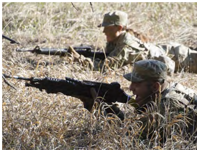
CADETS PREPARING TO FIRE WHILE CONDUCTING AN AMBUSH DURING THE SPRING LDX.

The Army Reserve Officers’ Training Corps (Golden Buffalo Battalion) commissioned a total of twenty-one Cadets this spring 2024. Alpha Company at CU-Boulder commissioned eight Cadets, Bravo Company at the Colorado School of Mines commissioned six Cadets, and Charlie Company at the Metropolitan State University of Denver commissioned seven Cadets.