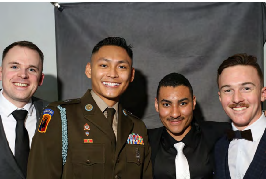
CADETS TAKING THE TIME TO POSE FOR A PICTURE WITH THEIR CLASSMATES AT THE 2024 MILITARY BALL.

By the end of the training session, the recruits were given a full picture of what they can expect during their academy training. And the Golden Buffalo Battalion was appreciative to have solidified a new partnership with the Boulder County Fire Department.