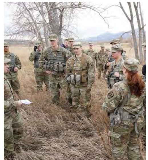
ACO CADETS DISCUSSING WHAT WILL HAPPEN DURING THE NEXT LAB EXERCISE.

Alpha Company used Spring Semester as the final conditions check to ensure that the MSIII (Juniors) were ready for Cadet Summer Training. This is generally known as the more challenging Fall semester, as Cadets have to practice what they have learned as MSIIIs are assessed on leadership attributes and competencies. Cadet summer training is one of their final assessments before being assessed into their preferred branch and component of choice. Over the last two years, Alpha Company has had a 95% success rate of Cadets earning their top choices. The assessment metrics include GPA, campus leadership evaluations for A CO cadre, physical fitness, and the overall metrics from their advanced camp scores. Advanced camp scores consider a lot of individual training, like land navigation, rifle marksmanship, medical, physical events, and leadership in the field through offensive and defensive missions.