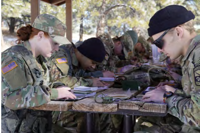
GBB CADETS PLOTTING POINTS ON THEIR LAND NAVIGATION MAPS.

moved onto the solo land nav practical course test. Those that received less than 70% were pared up with MSIV Cadets to refine their knowledge and land nav skills.