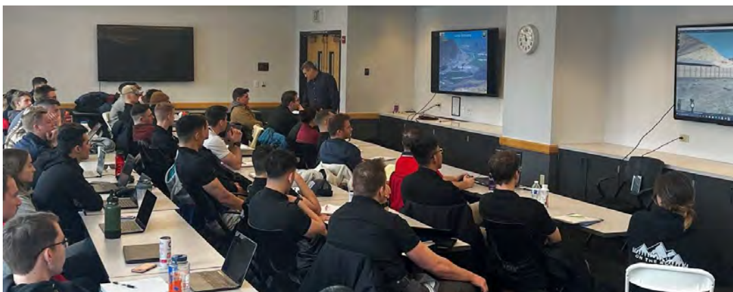
MSIV CADETS ATTEND THE VIRTUAL STAFF RIDE ON FEBRUARY 22, 2023.