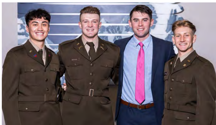
ACO CADETS POSING FOR A PIC AT THE BALL.

https://www.colorado.edu/arotc/2023/02/24/military-ball-february-2023