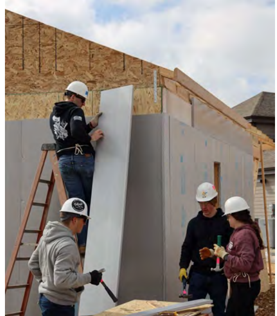
ACO CADETS AFFIXING THE “BLUE BOARDS” TO THE EXTERIOR OF A TINY HOME.

For more information about the Veterans Community Project or if you are interested in getting involved, please visit their website at: https://www.veteranscommunityproject.org/vcp-colorado