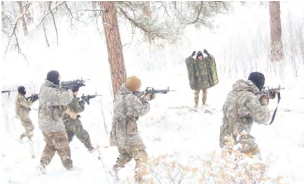
CADETS CLEAR AN AMBUSH OBJECTIVE AND TAKE ENEMY PRISONERS.

Cadets get “hands-on” experiences dealing with combat techniques and squad tactics in order to complete each mission’s objective. Even though the weather was less than ideal (lows in the 20’s°), the Cadets took it all in stride.