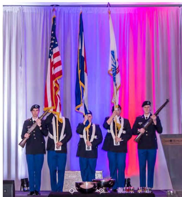
ARMY ROTC COLOR GUARD PREPARING TO POST THE COLORS ON STAGE AT THE ANNUAL MILITARY BALL.