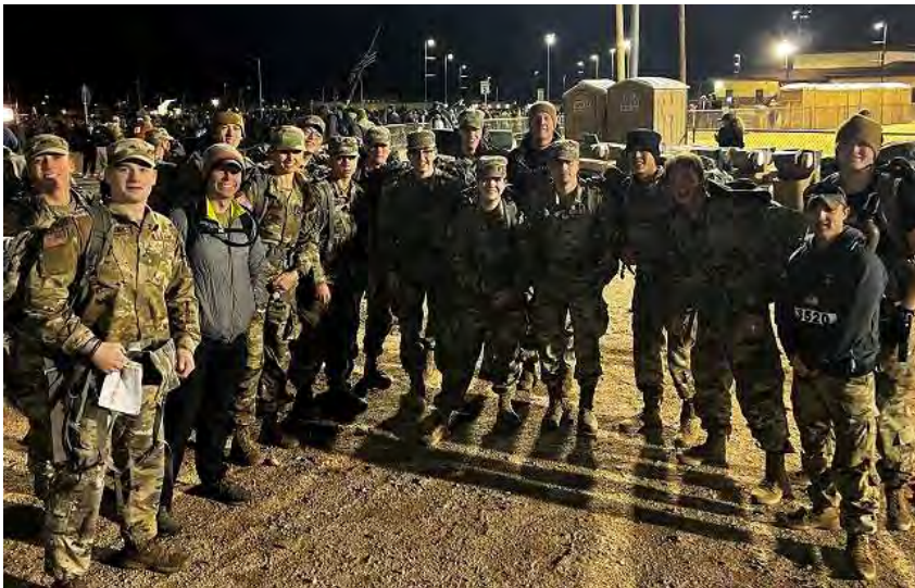
ARMY ROTC CADETS AND CADRE GETTING READY TO START THE 2023 BATAAN DEATH MARCH IN WHITE SANDS MISSILE RANGE.

competition with a time of 6 hours 30 minutes; Team #1 ACO finished fourth out of around 25 other teams; Team #2 from CCO persevered through some injuries and were able to finish as a team.