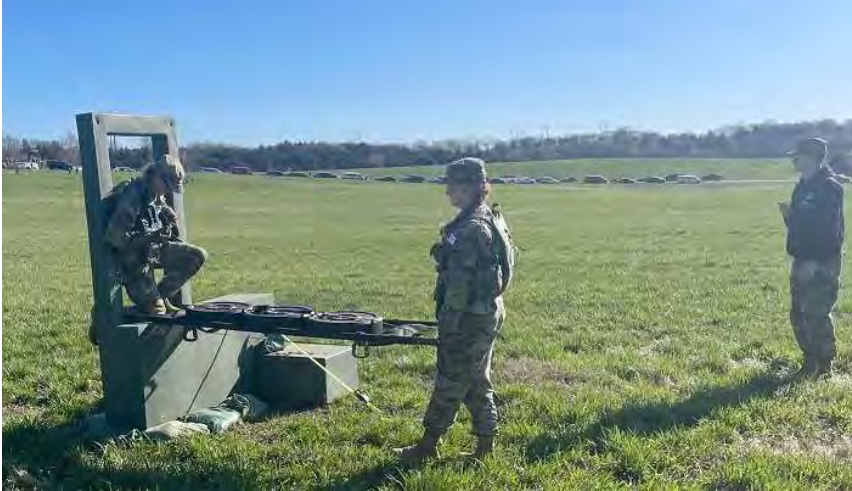
THE FEMALE TEAM WORKING THROUGH VARIABLE DURING THE MEDEVAC LITTER CARRY EVENT.

The 27th annual Army ROTC Ranger Buddy Competition was hosted by the University of Kansas (KU), and was held at Clinton Lake on Saturday, April 8, 2023. Two-person teams (either all male, all female or co-ed) converge on the town of Lawrence to test their skills, representing forty-three universities. The Golden Buffalo Battalion sent three teams to compete this year: 1 Male Team, 1 Female Team, and 1 Co-ed Team (plus one alternate).