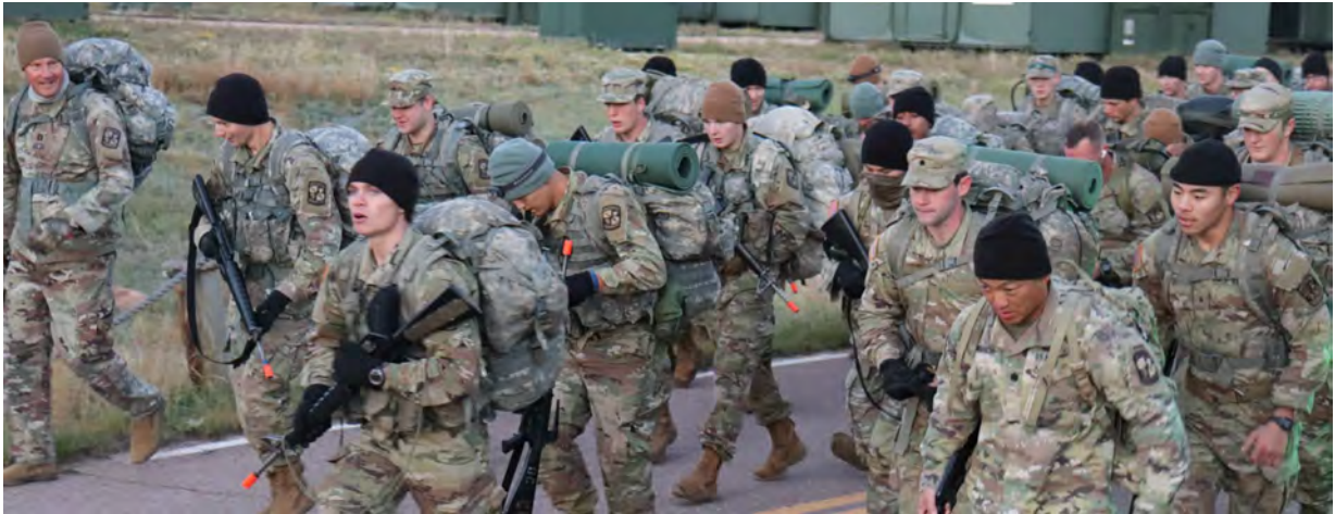
ARMY ROTC CADETS AND CADRE BEGINNING THE 6-MILE RUCK MARCH ON THE LAST DAY OF FTX.