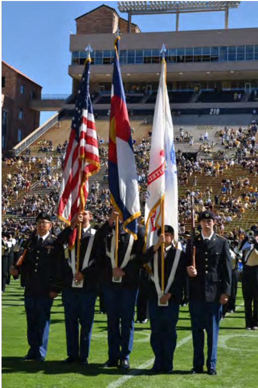
ARMY ROTC COLOR GUARD CADETS DISPLAY THE COLORS IN FRONT OF THE CU BAND AT FOLSOM STADIUM.

The new Cadets woke up early on Friday morning for a group run over to the Chautauqua Park trail and run up the main trail to the first flat outcropping. Cadets rested at the base of Chautauqua upon their return trip down to enjoy some fresh water/energy drinks along with some power bars, if needed. The Cadets made the return run to the campus after the short rest.