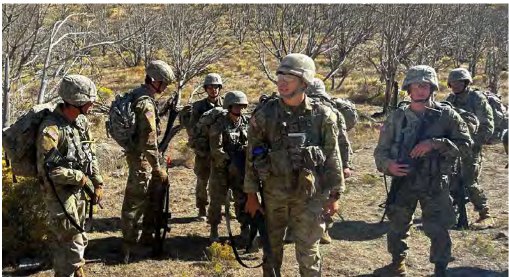
ARMY ROTC CADETS PREPARING TO MOVE ON TO THE NEXT EVENT DURING RANGER CHALLENGE.