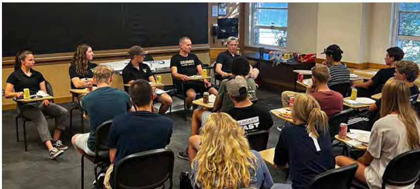
FRESHMEN CADETS ARE TREATED TO A PIZZA DINNER AND GIVEN THE OPPORTUNITY TO ASK QUESTIONS OF THE UPPERCLASSMEN.

Thursday night activities wound down with a meet-n-greet informal pizza dinner in the Cadet Lounge. New students were given the opportunity to ask any questions they had to the upperclassmen and Cadre.