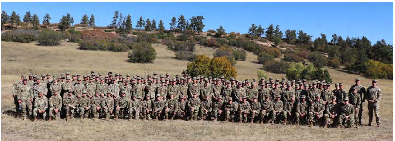
GOLDEN BUFFALO BATTALION PHOTO FALL FTX 2022