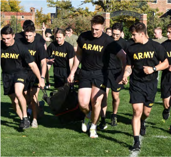
ARMY CADETS WORK TOGETHER TO RUN THE LITTER CARRY AROUND THE FIELD.

The competition began with the 4-person litter carry (180 lb. weight in the poleless nonrigid litter) that circled the field twice per team. The next event was the sprint-drag-carry (90 lb. weight drag, full water jug carry with 25 push-ups in between). Following the circuit events came the tug-of-war and pugil stick matches. The final event was the PMS or ROTC unit commander competition. Each commander had to do the weight drag, kettle bell carry with push-ups in between, finished off by a sprint across the field.