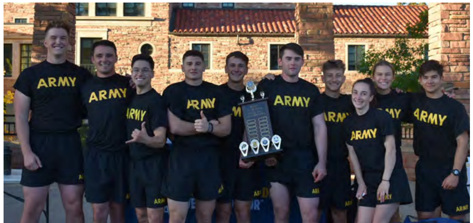
ARMY ROTC CADETS CELEBRATING THEIR FIRST PLACE VICTORY IN THE ANNUAL TRI-MILITARY SERVICE COMPETITION ON OCTOBER 13, 2022.