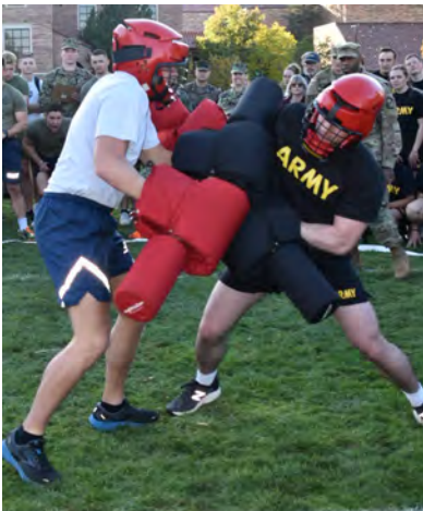
PUGIL STICK MATCH BETWEEN AN ARMY CADET AND AN AIR FORCE CADET.

For this year's event, we could not have asked for better weather – sunny with about a high of 70 degrees. The layout and activities of the competition were modified for this year. Instead of individual events taking place around the field, the competition was set-up in several circuit/stages where all competitors had to finish one activity before they could start the next.