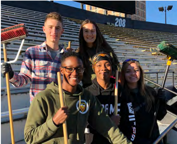
ARMY ROTC CADETS SMILE FOR THE CAMERA BEFORE GOING BACK TO THEIR SWEEPING DUTIES.

CU Athletics contracts on an annual basis with the 3 CU ROTC units on campus (Army, Air Force, and Navy/Marines) to conduct the Stadium Clean-ups each football season. The clean-up includes inside the Folsom Stadium stands, the Franklin Field tailgate lot and the perimeter around the Stadium. Each ROTC unit is assigned two of the six total home games on the schedule. The Army ROTC department uses the money received from the clean-ups to fund equipment purchases, program enrichment and Cadet related events.