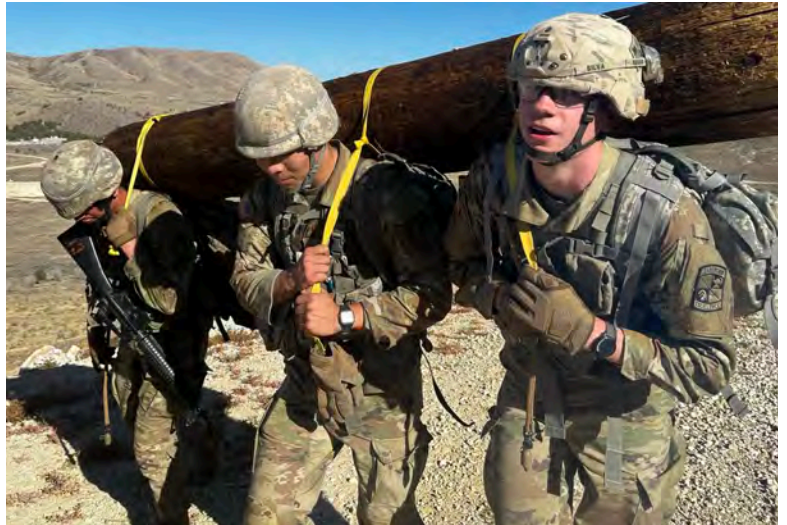
CADETS SHOWING THEIR STRENGTH AND TEAMWORK AS THEY MANEUVER A LOG DOWN A ROCKY PATH.

The event was held on October 13-14, 2022 at Camp Williams, Utah. Eleven teams from across Utah, Wyoming, Idaho and Colorado attended the competition – representing 9 different colleges or universities. Each team competed for the win here, so they could move onto the Brigade competition.