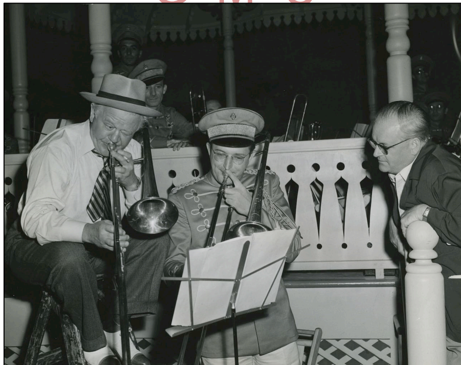
At M-G-M with Charles Winninger, "Broadway Rhythm"