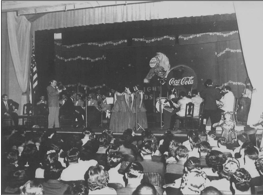
G M C Spotlight Bands Broadcast