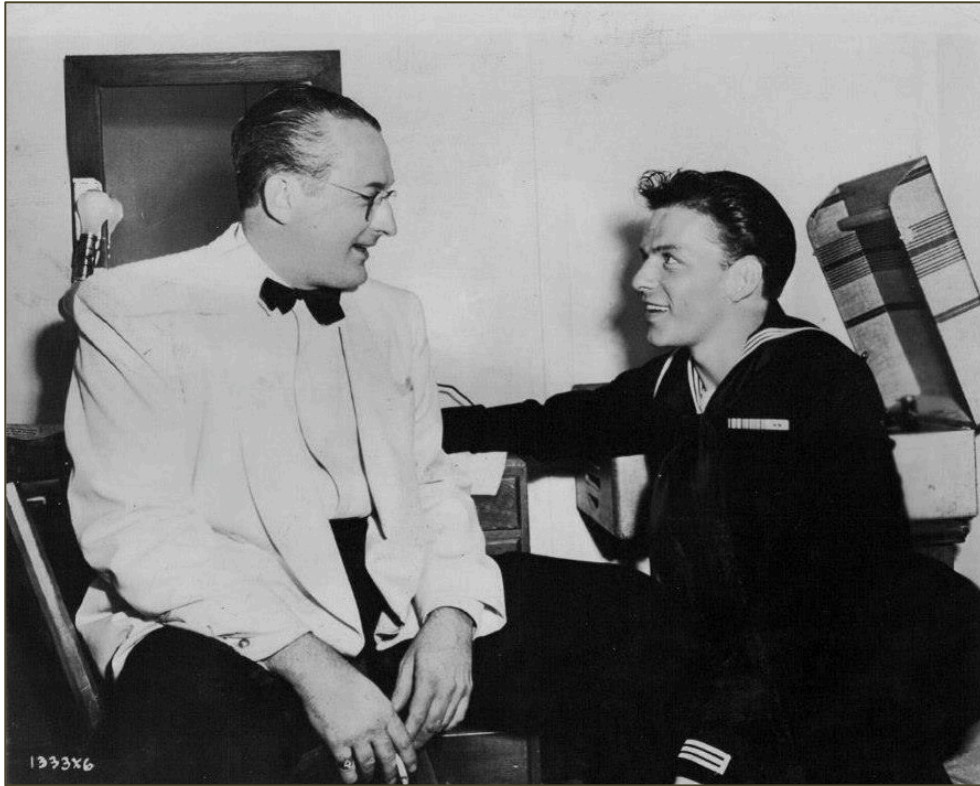
Tommy Dorsey and Frank Sinatra at M-G-M, August-November 1944 During filming of "Thrill of a Romance" (TD) and "Anchors Aweigh" (The Voice)