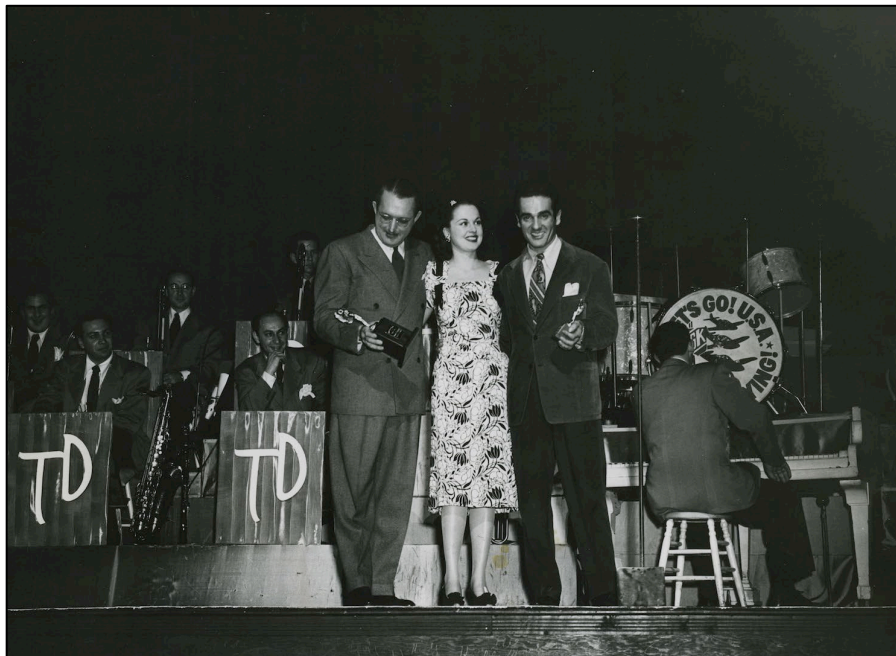
TD and Gene Krupa Onstage, Paramount Theatre, December 1943