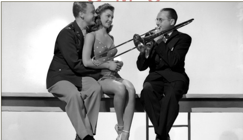
M-G-M Publicity Still, "Thrill of a Romance" August-November 1944 Van Johnson, Esther Williams, Tommy Dorsey