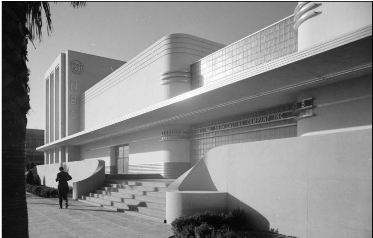
NBC Radio City Hollywood