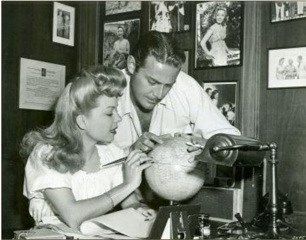
Jon Hall and Frances Langford