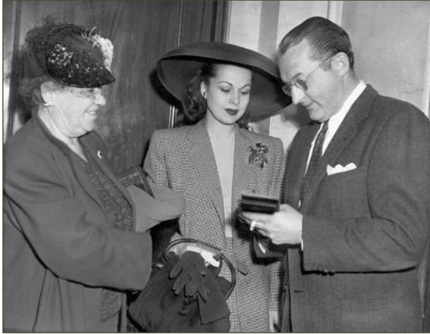
Tommy Dorsey with his mother and wife Pat Dane "Taking the Fifth"