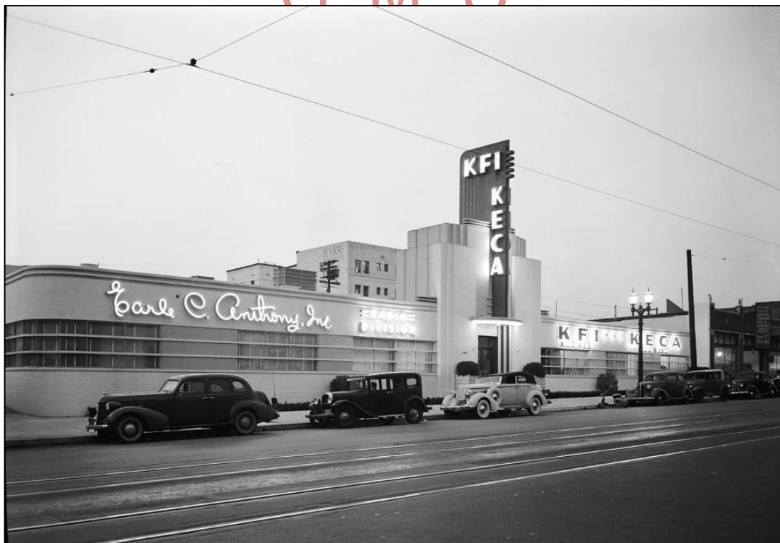
KFI and KECA, Los Angeles