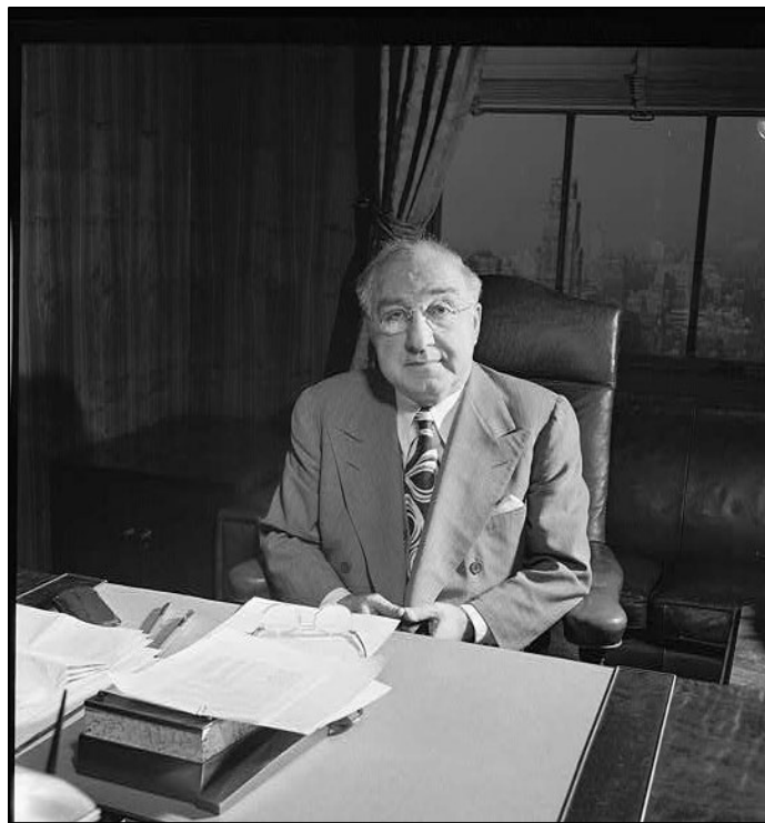
James Cesar Petrillo American Federation of Musicians

"New York, Nov. 13 - It's all over brother, including the shouting! Yep, on Armistice Day, November 11, somewhere around 6 pm after five hours of clearing legal throats, bantering words back and forth, Mr. James C. Petrillo, president of the American Federation of Musicians, sat back in his leather chair, victor in a heated and spirited contest that ran some 28 months. And you can believe it, that this armistice marks the end of hostilities that were as bitter and hard fought as World War I. Skimming over the contracts that RCA-Victor, on behalf of its recording corporation, and Columbia Recording Corporation signed, two additional clauses were noted as having been inserted into the contract that Decca and some 100 additional companies signed in September 1943. These additional clauses have plenty of bite in them and setup a system whereby the AFM "protects" itself in case the whole thing should happen again after the present contract (one that was just signed expires on December 31, 1947. Harry James will be the first to disk for Columbia, cutting two sides today (13) a 11 am Vaughn Monroe was the first RCA-Victor band to disk, cutting four sides yesterday ... Tommy Dorsey is set to record the first week on the coast" 67