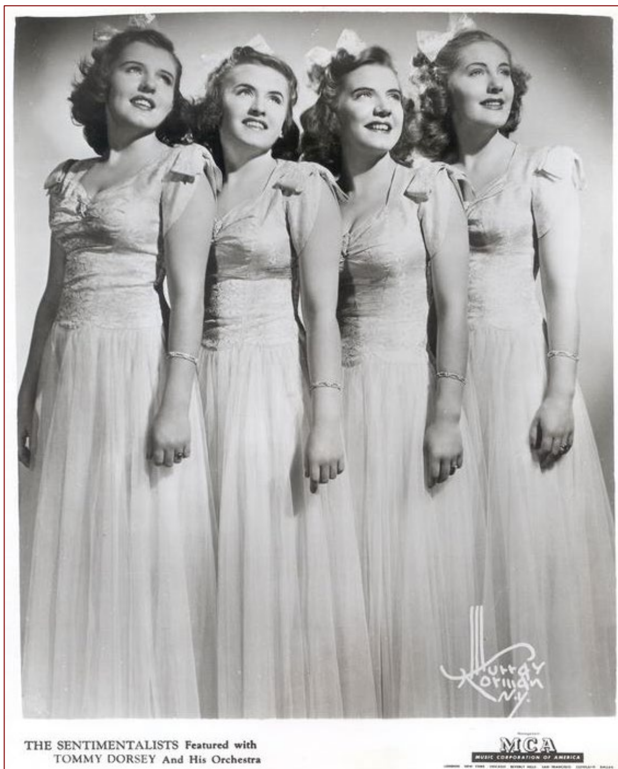
The Sentimentalists (GMA Edward Burke Collection)