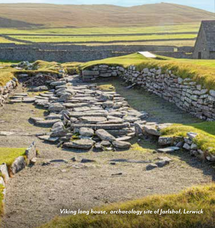
Viking long house, archaeology site of Jarlshof, Lerwick