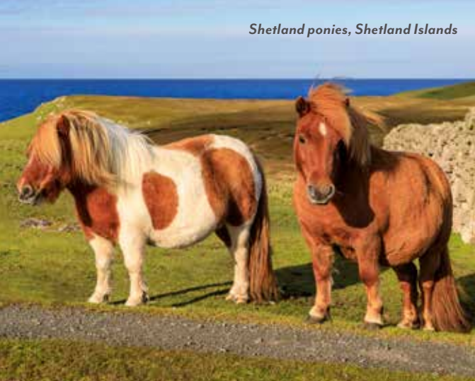
Shetland ponies, Shetland Islands