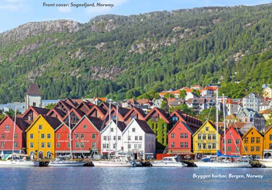
Bryggen harbor, Bergen, Norway