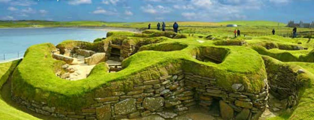
Skara Brae, Orkney Islands

Following breakfast, continue on the Post-Program Option or transfer to the airport for your return flight home. (B)