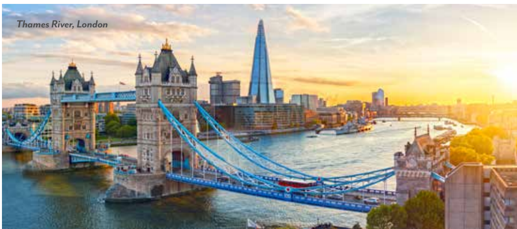
Thames River, London

Following breakfast, disembark and continue to the London Post-Tour Extension or transfer to the airport for your return flight home. (B,L,D)