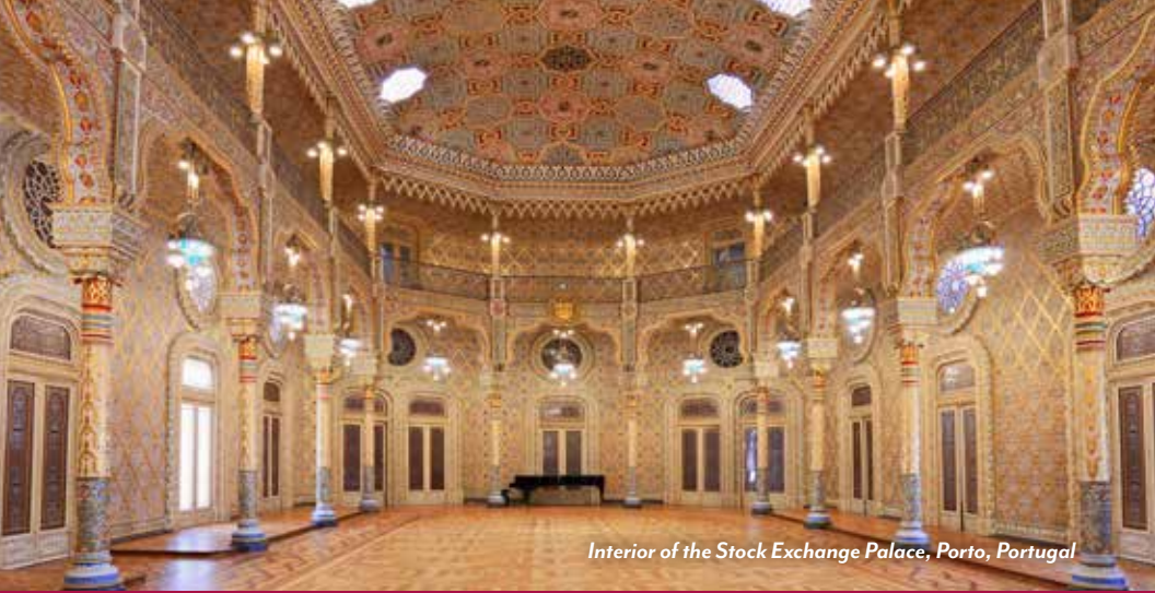
Interior of the Stock Exchange Palace, Porto, Portugal

Heritage-designated Mont-Saint-Michel is a sight of soaring spires isolated beyond a stretch of saltwater marsh.