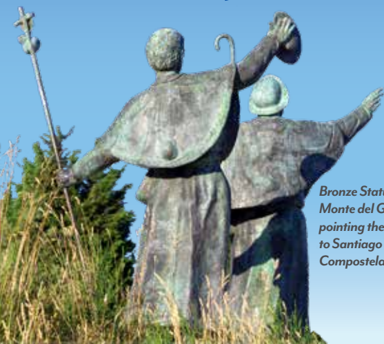
Bronze Statues at Monte del Gozo pointing the way to Santiago de Compostela (right)