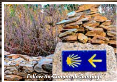
Follow the Camino de Santiago