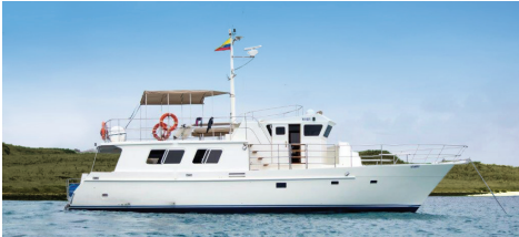
We stay in comfort for four nights in spacious rooms at the Royal Palm Hotel, set in the lush highlands of Santa Cruz island, and enjoy day cruises aboard the Santa Fe, our privately chartered yacht.