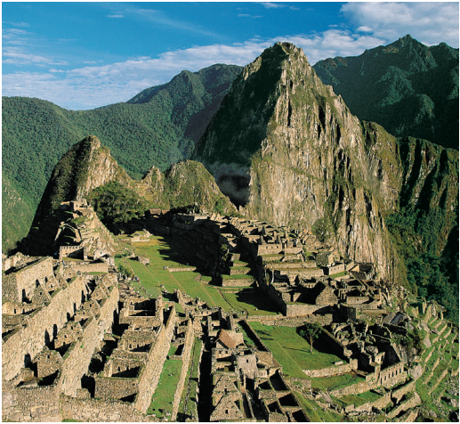
We explore the amazing ruins at Machu Picchu on Days 5 & 6.

Day 15: Quito/Depart for U.S. Nestled in Andes foothills, Quito boasts a well-preserved historic center,